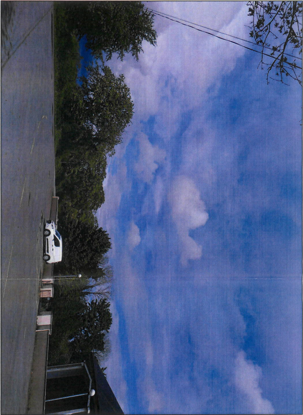
VRP3 - WITHOUT SOLUTION IN PLACE