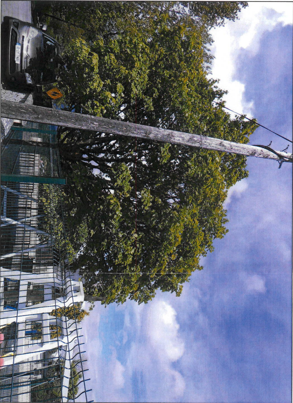
VRP4 - SOLUTION IS NOT VISIBLE