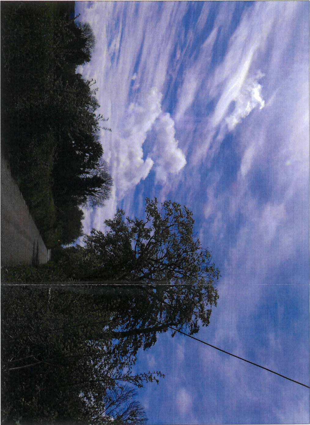
VRP1 - WITHOUT SOLUTION IN PLACE