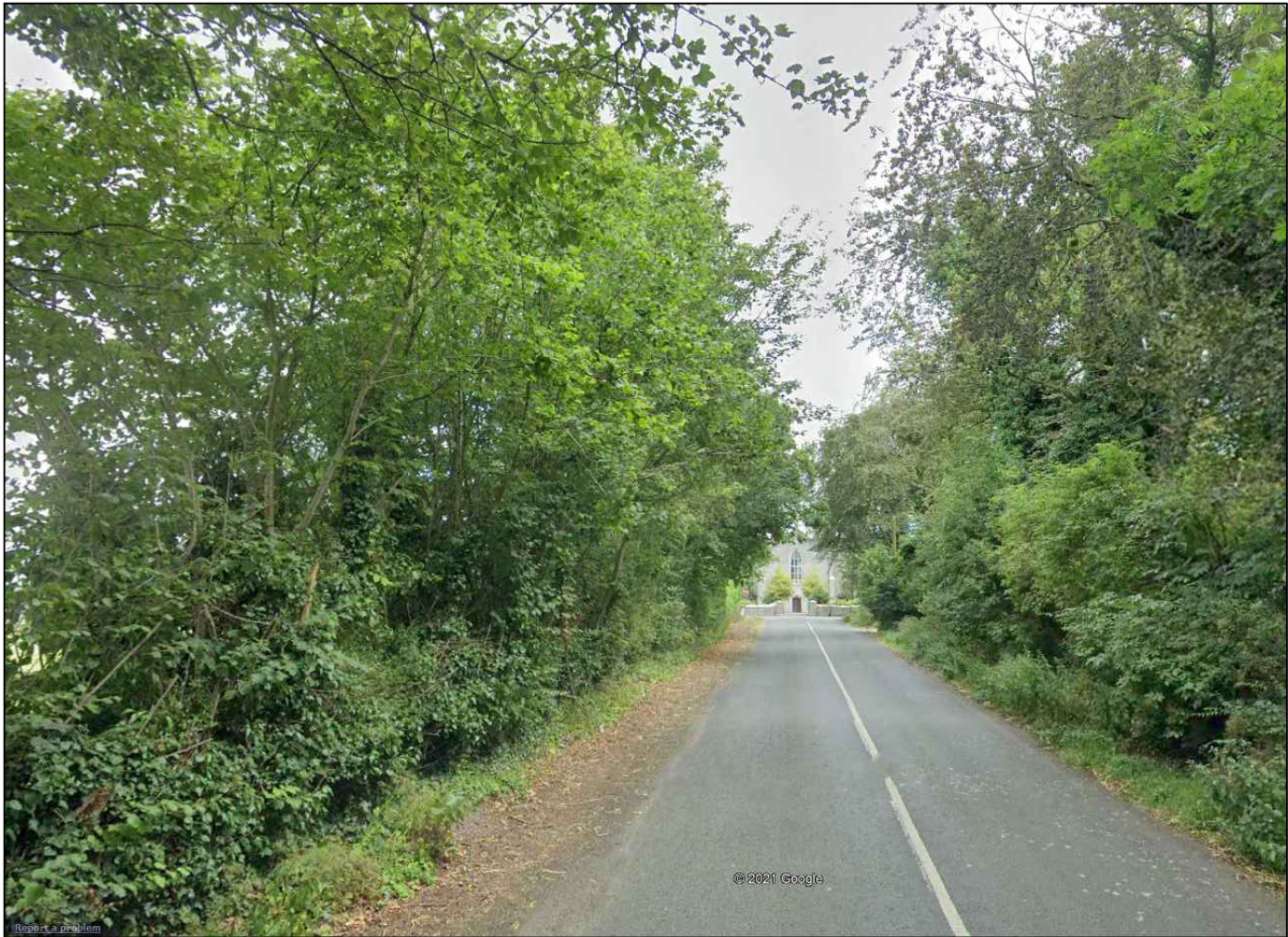
VRP1 - WITHOUT SOLUTION IN PLACE