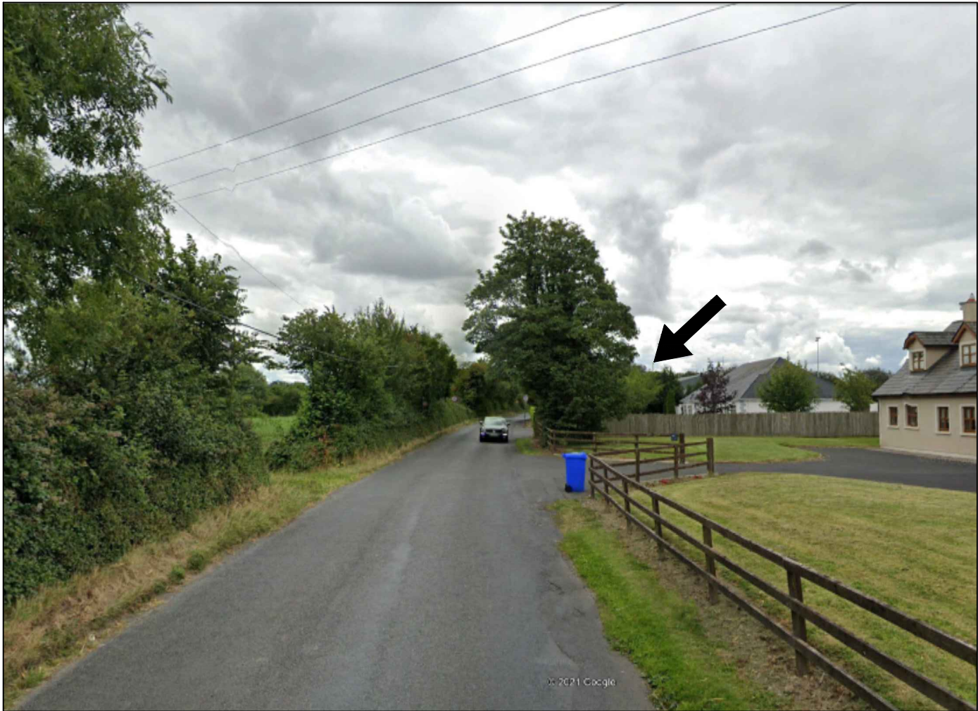
VRP7 - WITHOUT SOLUTION IN PLACE