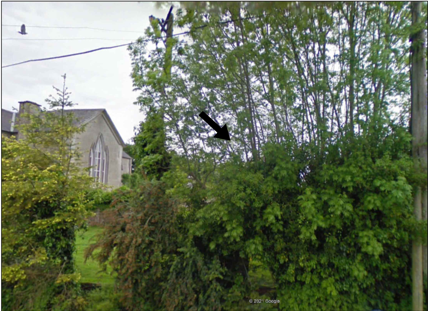
VRP8 - WITH SOLUTION IN PLACE

THIS DRAWING IS TO BE READ IN CONJUNCTION WITH ALL ENGINEERS & ARCHITECTS DRAWINGS. FIGURED DIMENSIONS ONLY (NOT SCALING) TO BE USED. WHERE A CONFLICT OF INFORMATION EXISTS OR IF IN ANY DOUBT - ASK CONSULTANTS TO BE INFORMED IMMEDIATELY OF ANY DISCREPANCIES BEFORE WORK PROCEEDS.