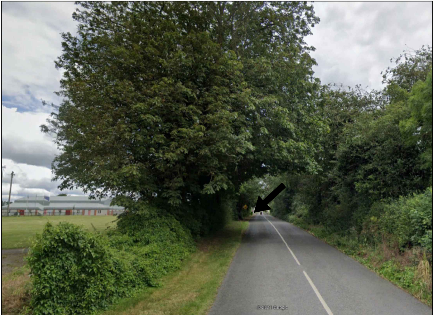
VRP4 - WITH SOLUTION IN PLACE

THIS DRAWING IS TO BE READ IN CONJUNCTION WITH ALL ENGINEERS & ARCHITECTS DRAWINGS. FIGURED DIMENSIONS ONLY (NOT SCALING) TO BE USED. WHERE A CONFLICT OF INFORMATION EXISTS OR IF IN ANY DOUBT - ASK CONSULTANTS TO BE INFORMED IMMEDIATELY OF ANY DISCREPANCIES BEFORE WORK PROCEEDS.