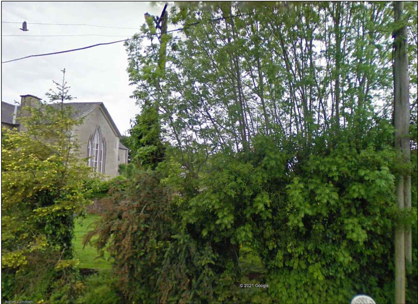
VRP8 - WITHOUT SOLUTION IN PLACE