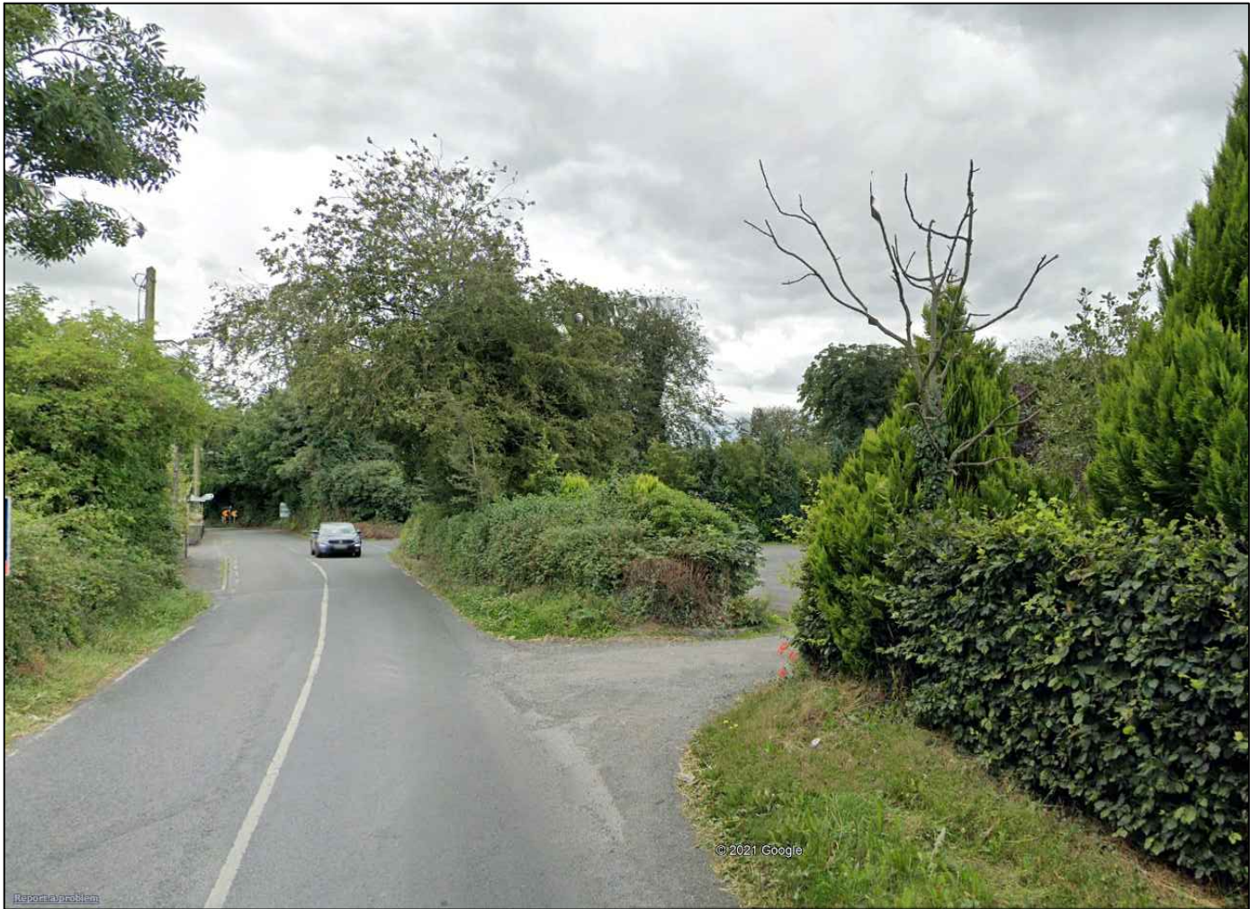
VRP2 - WITHOUT SOLUTION IN PLACE