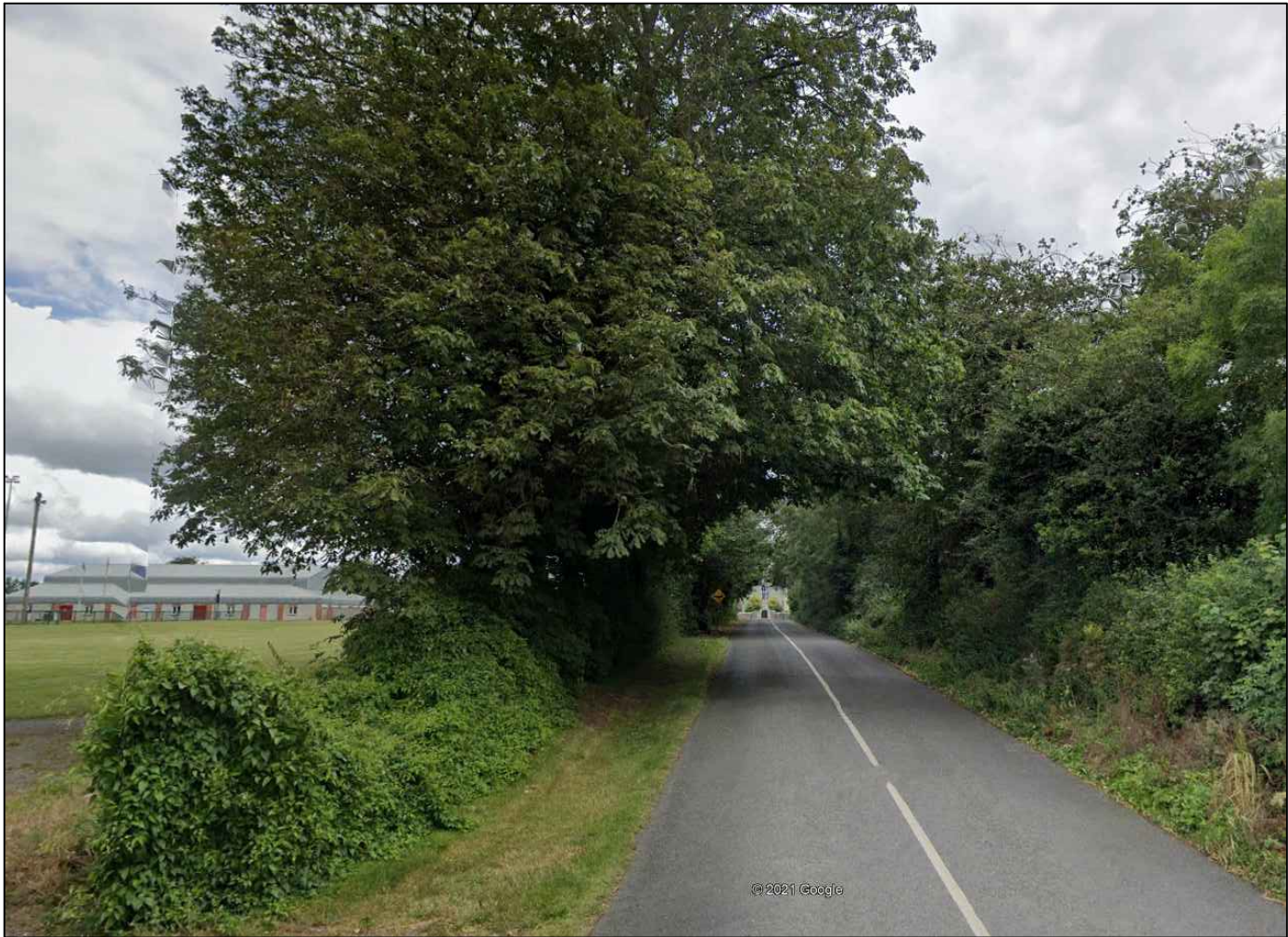
VRP4 - WITHOUT SOLUTION IN PLACE