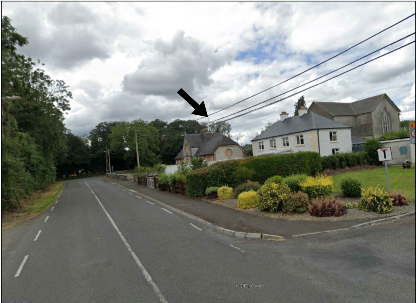
VRP9 - WITHOUT SOLUTION IN PLACE