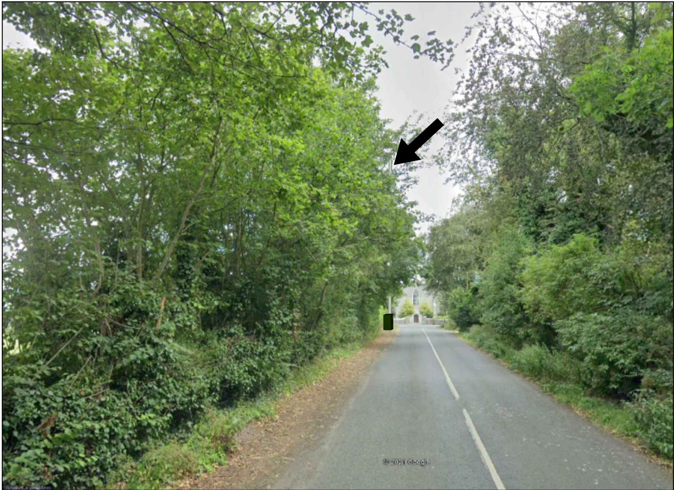
VRP1 - WITH SOLUTION IN PLACE

THIS DRAWING IS TO BE READ IN CONJUNCTION WITH ALL ENGINEERS & ARCHITECTS DRAWINGS. FIGURED DIMENSIONS ONLY (NOT SCALING) TO BE USED. WHERE A CONFLICT OF INFORMATION EXISTS OR IF IN ANY DOUBT - ASK CONSULTANTS TO BE INFORMED IMMEDIATELY OF ANY DISCREPANCIES BEFORE WORK PROCEEDS.