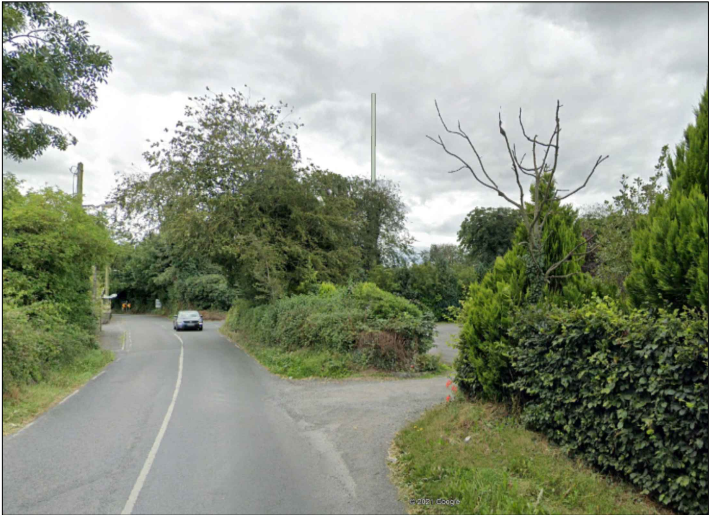
VRP2 - WITH SOLUTION IN PLACE

THIS DRAWING IS TO BE READ IN CONJUNCTION WITH ALL ENGINEERS & ARCHITECTS DRAWINGS. FIGURED DIMENSIONS ONLY (NOT SCALING) TO BE USED. WHERE A CONFLICT OF INFORMATION EXISTS OR IF IN ANY DOUBT - ASK CONSULTANTS TO BE INFORMED IMMEDIATELY OF ANY DISCREPANCIES BEFORE WORK PROCEEDS.