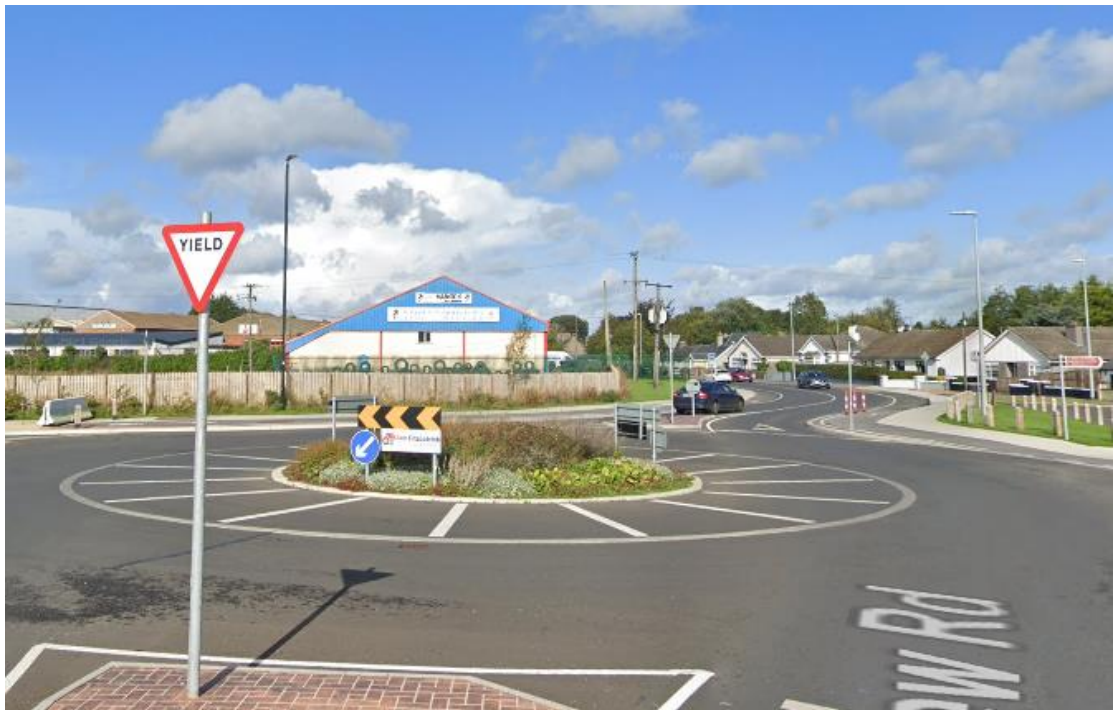
C2.2 Timahoe Road/Pairc an Phobail Roundabout