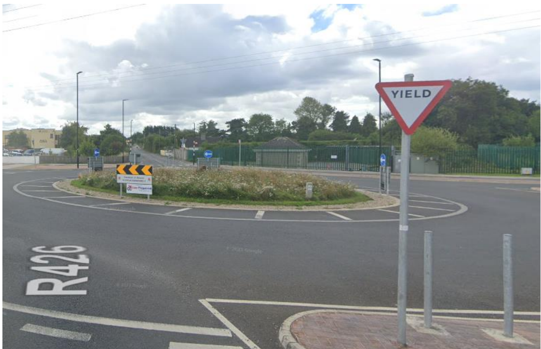
C3.1 O'Doran Roundabout