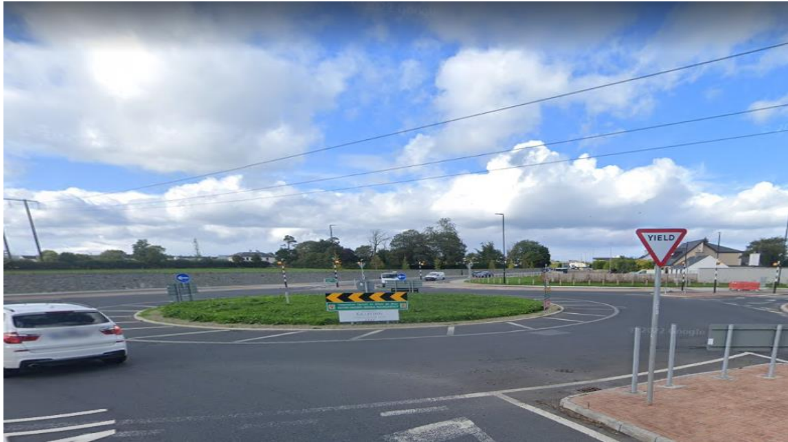
C1.3 Fr Browne Ave Roundabout