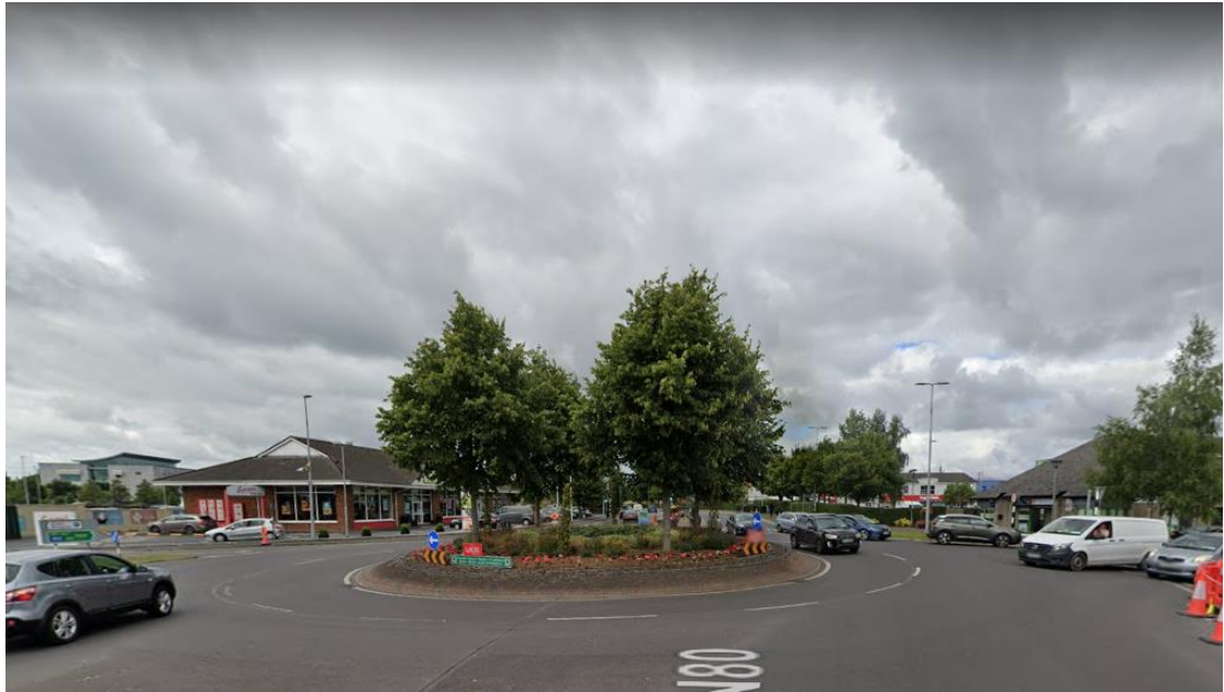
C1.1 - N80 James Fintan Lalor Ave Roundabout