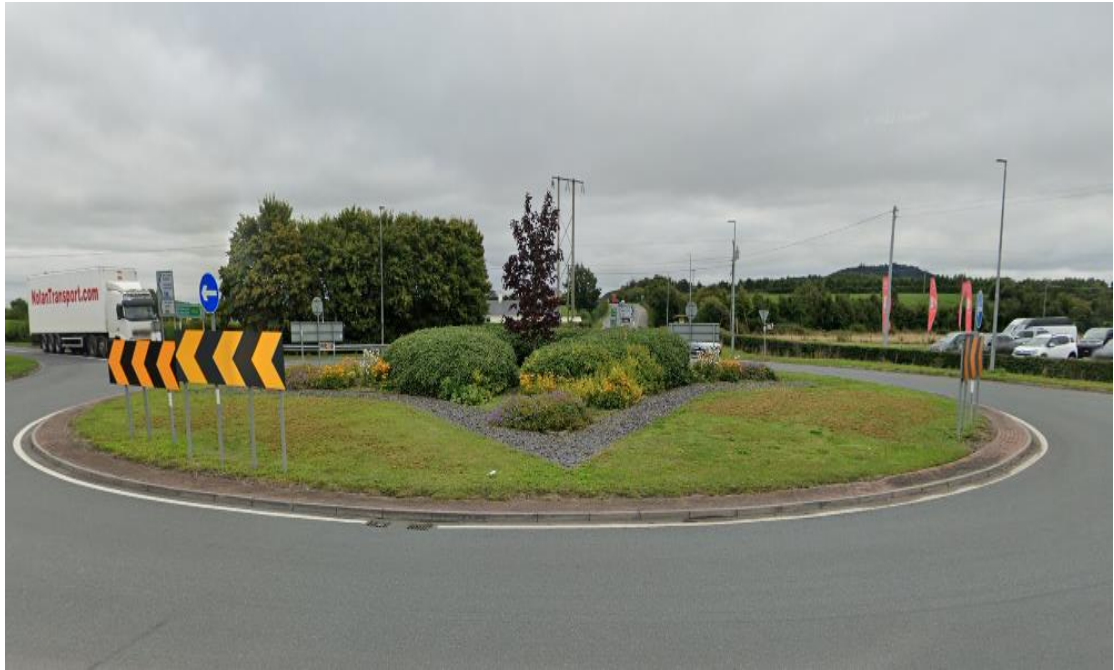
C2.3 Ballymacken Roundabout