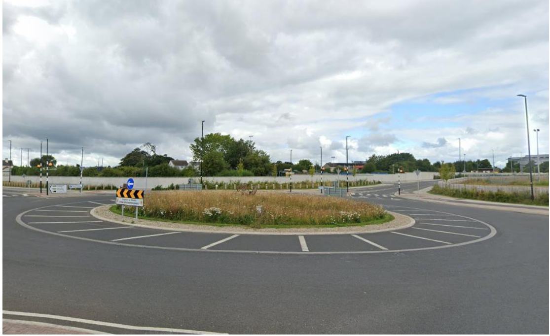
C3.2 O'More (O'Moore) Roundabout