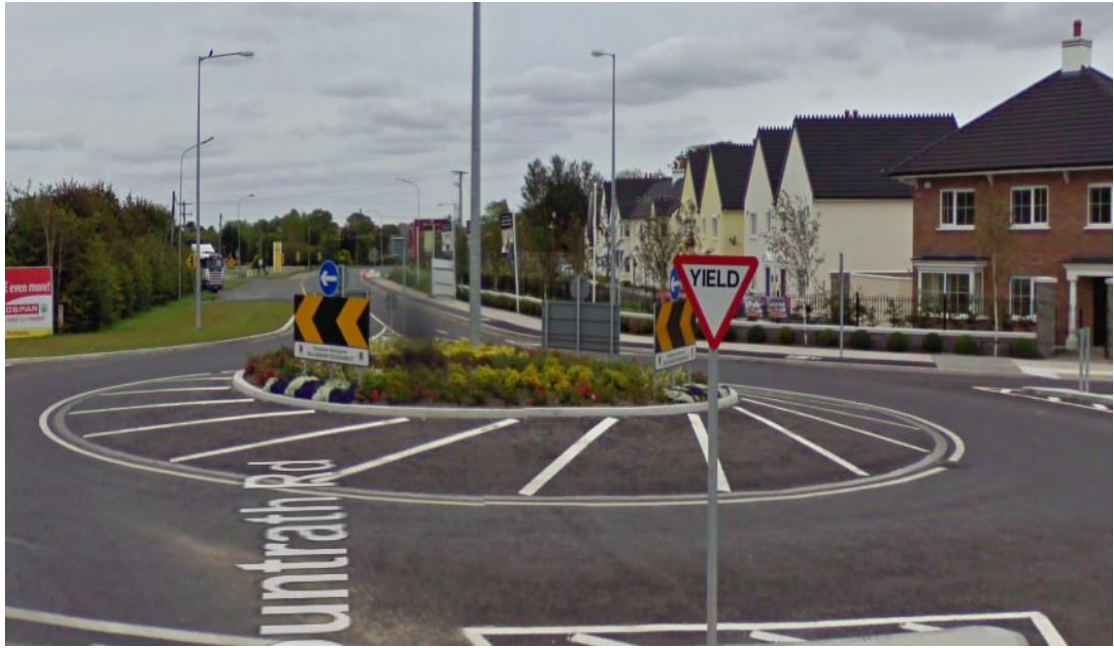
C2.1 Boghlone Roundabout