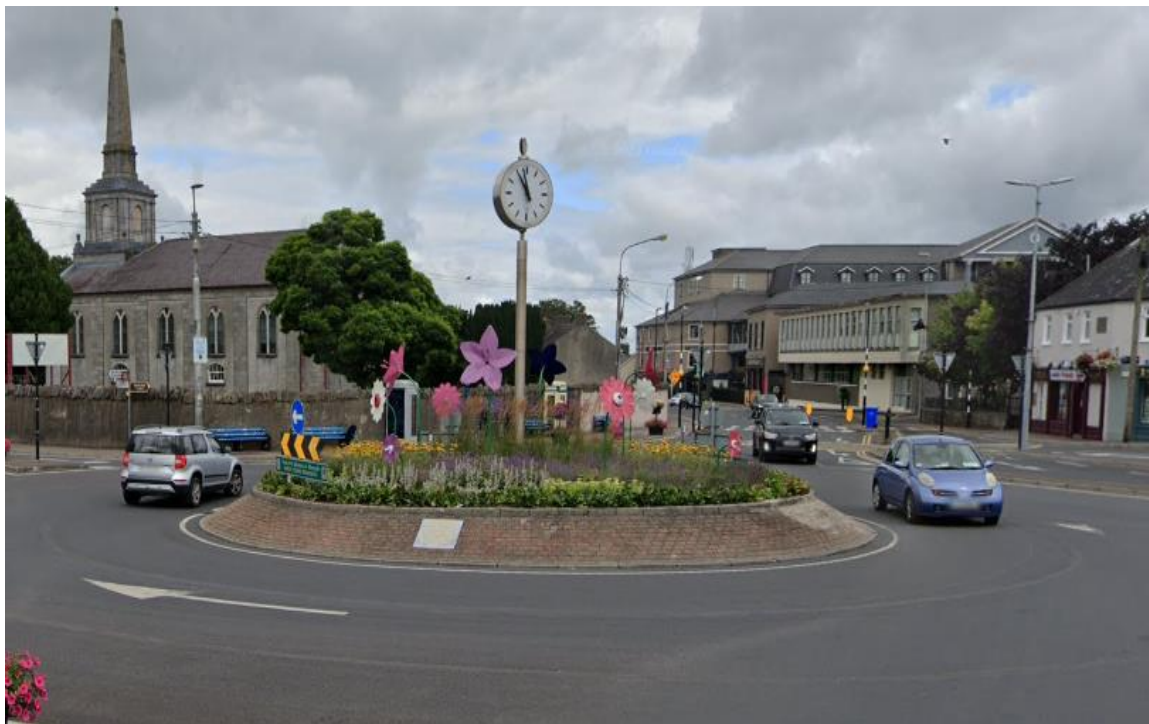
C1.4 - Market Square Roundabout