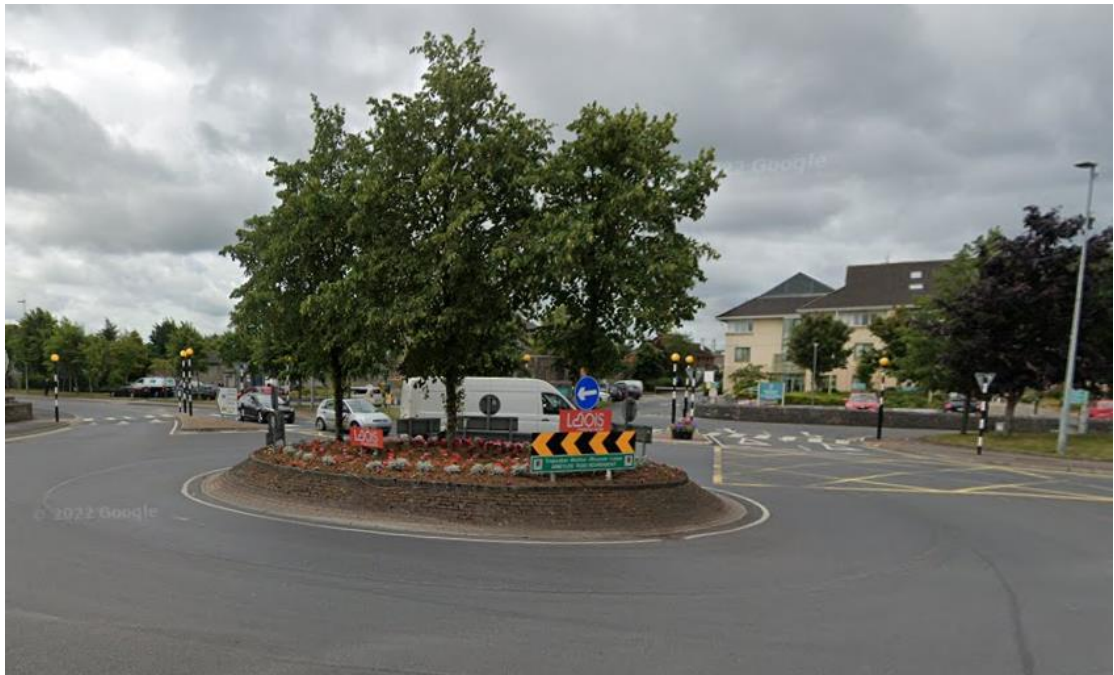
C1.2 - N80/N77 Abbyleix Road Roundabout