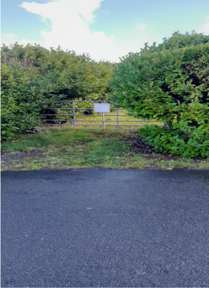
Photo of site notice on Derry Road, Durrow