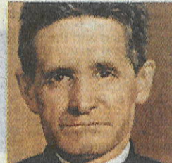
Rupert Mayer, 'The Apostle of Munich'