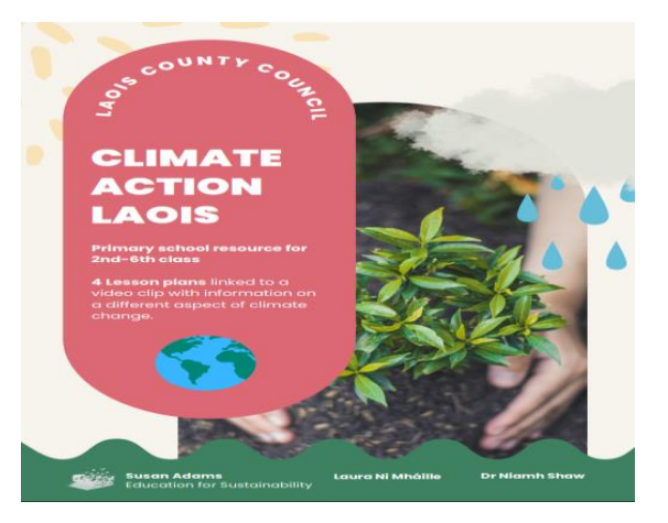
New resource for Primary schools, Climate Action Laois.

A new Primary school resource linked to the Abbeyleix Climate Action Walk Animated Series was launched. There are 4 Lesson plans for 2nd-6th classes, each linked to one of the walk videos, with information and activities on a different aspect of climate change.