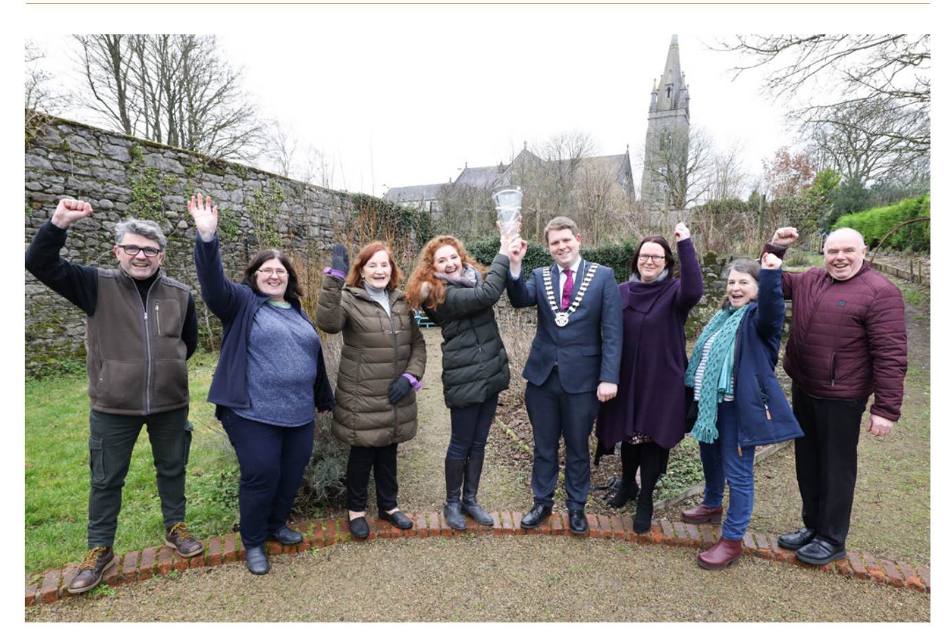
Abbeyleix Climate Action Project, winner of the Sustainable Communities category in the Chambers Ireland Excellence in Local Government Awards 2021.

The Festival of Flight led by the Col Fitzmaurice Commemoration Committee was in partnership with Laois County Council Heritage Office, Creative Laois, Laois Heritage Society, Music Generation Laois, Dunamaise Arts Centre, Midlands Science, and the Heritage Council. This multidisciplinary festival featured a maelstrom of activities including: