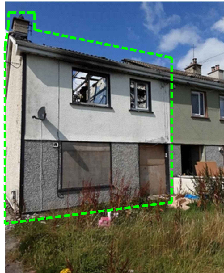
02 Front Elevation