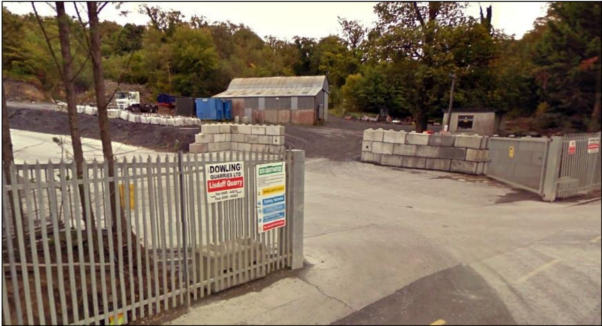
Entrance to Lisduff Quarry.