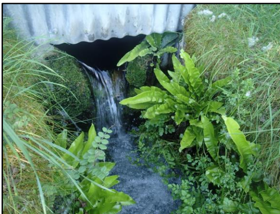
The spring emerging at surface, flowing across a 90 degree weir.