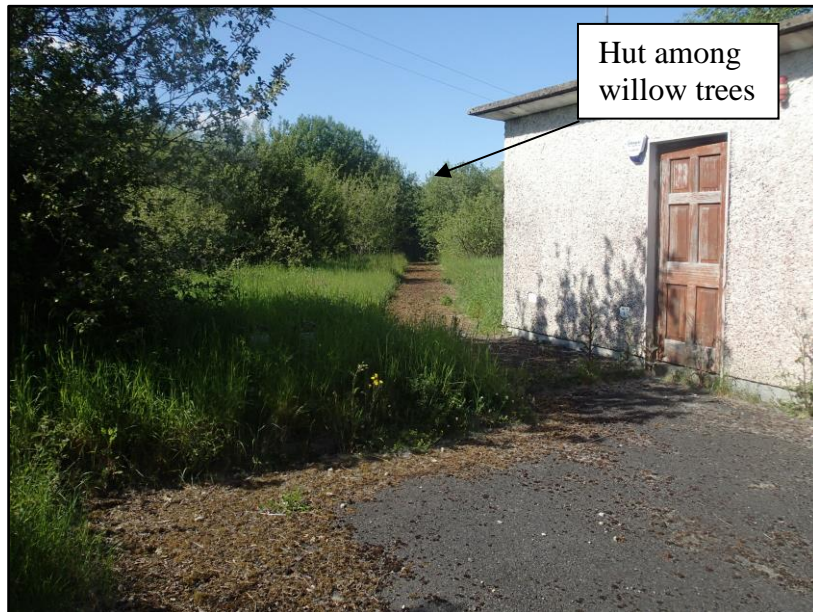
Looking northwards from the entrance to the spring hut.