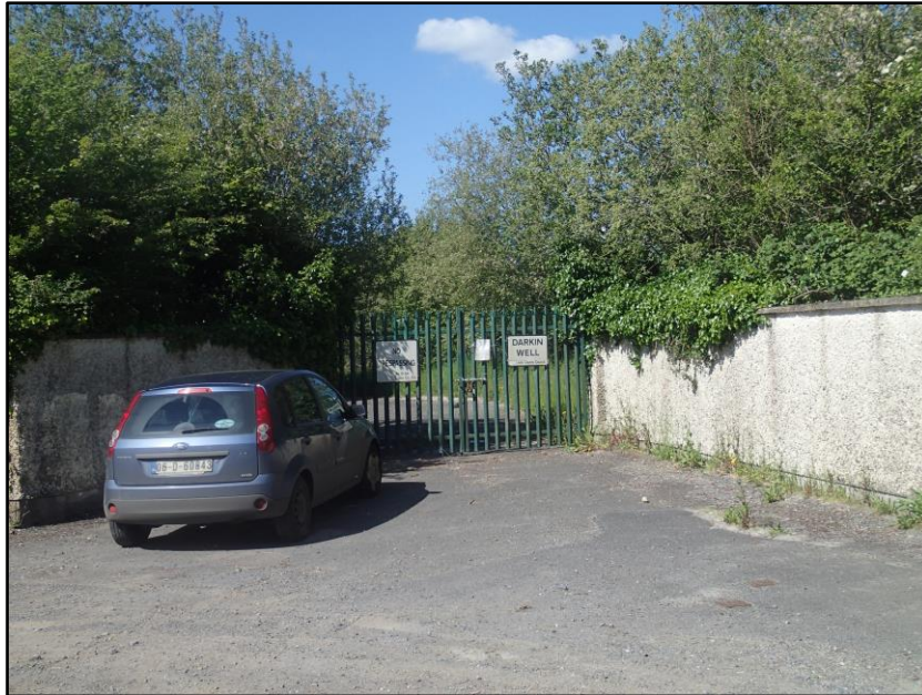
The Darkin Well compound, taken from the road at its entrance.