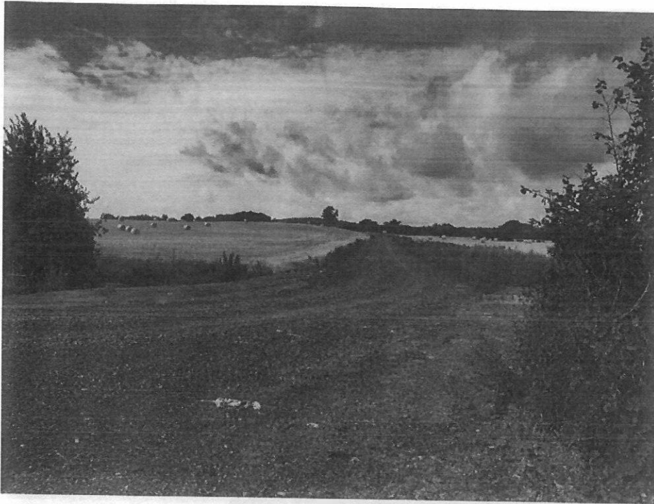
Figure 3: Newly constructed road complete