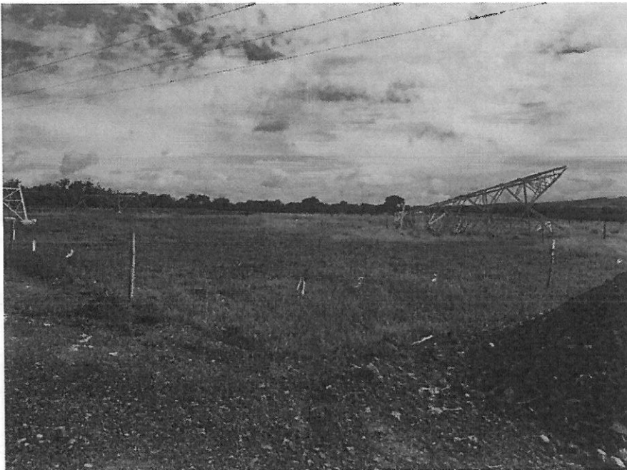
Figure 2: No works or operations on site at time of inspection