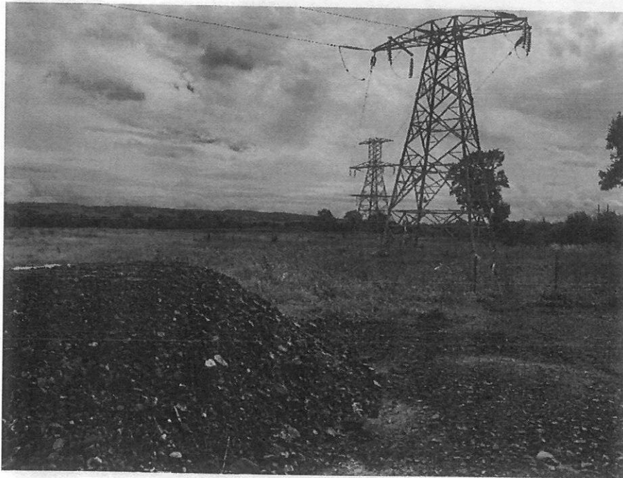
Figure 4: No operations or works on site