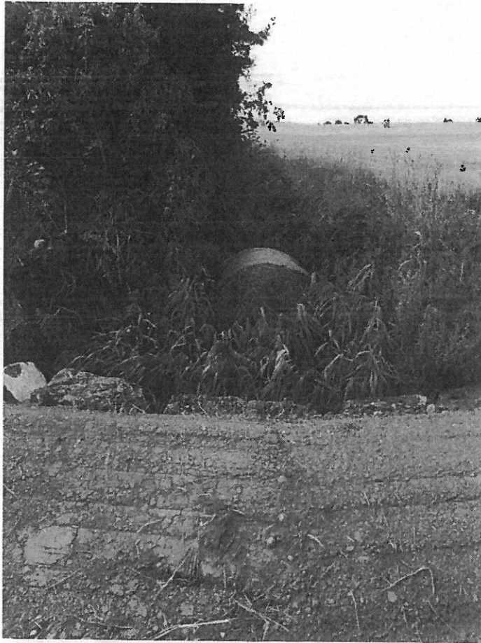
Figure 5: Satisfactory protection of land drains