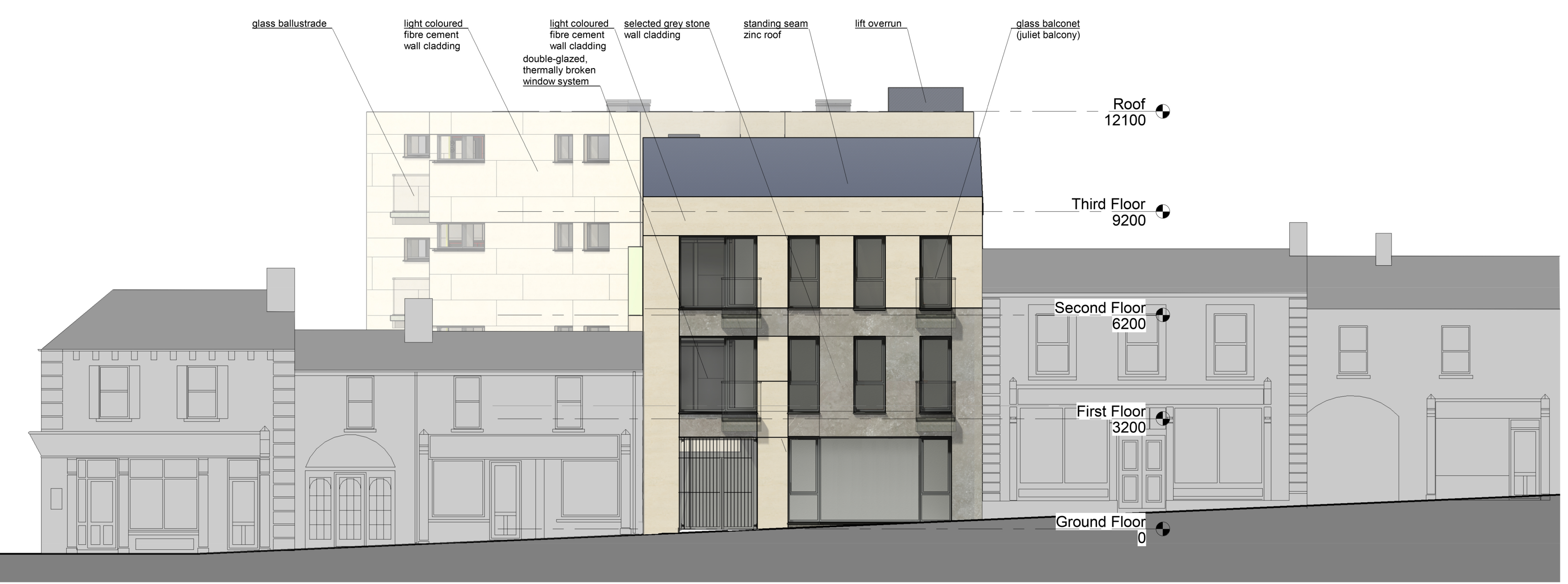
③ North (Main Street) Elevation 1: 100