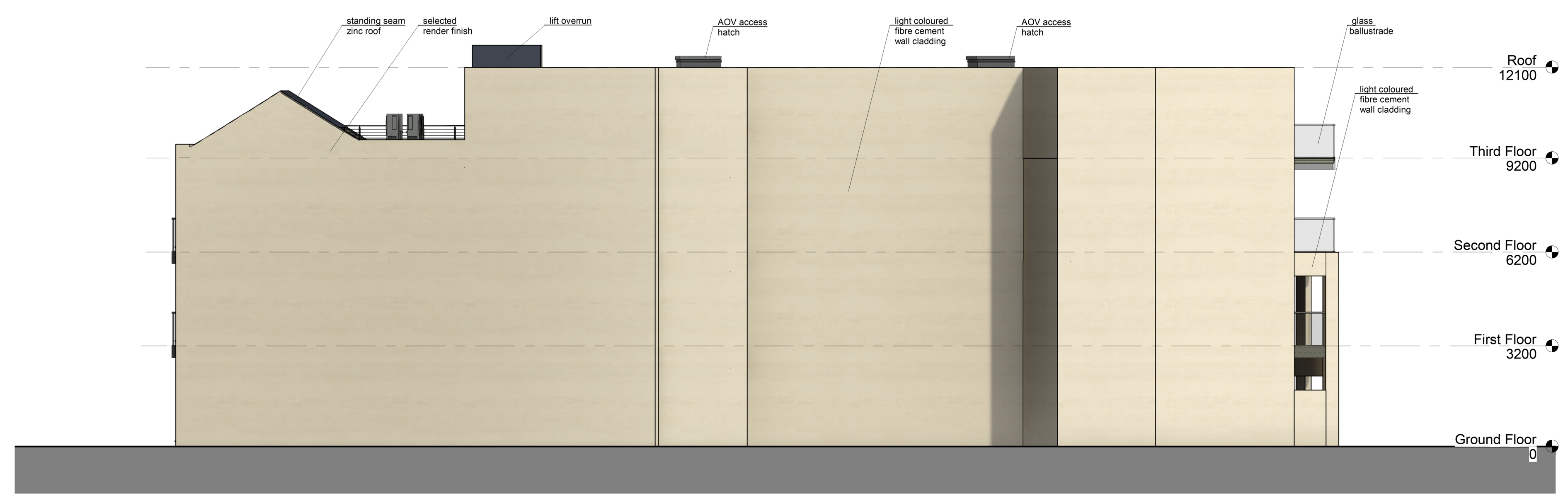
④ West Elevation 1: 100