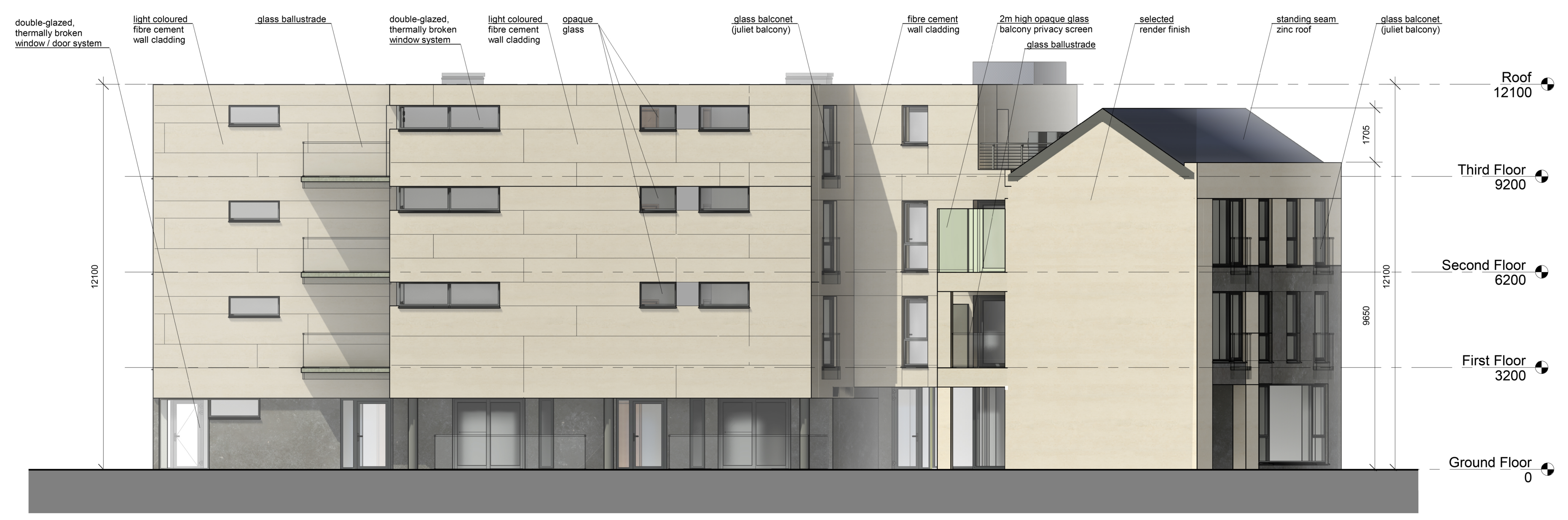
① East Elevation 1: 100