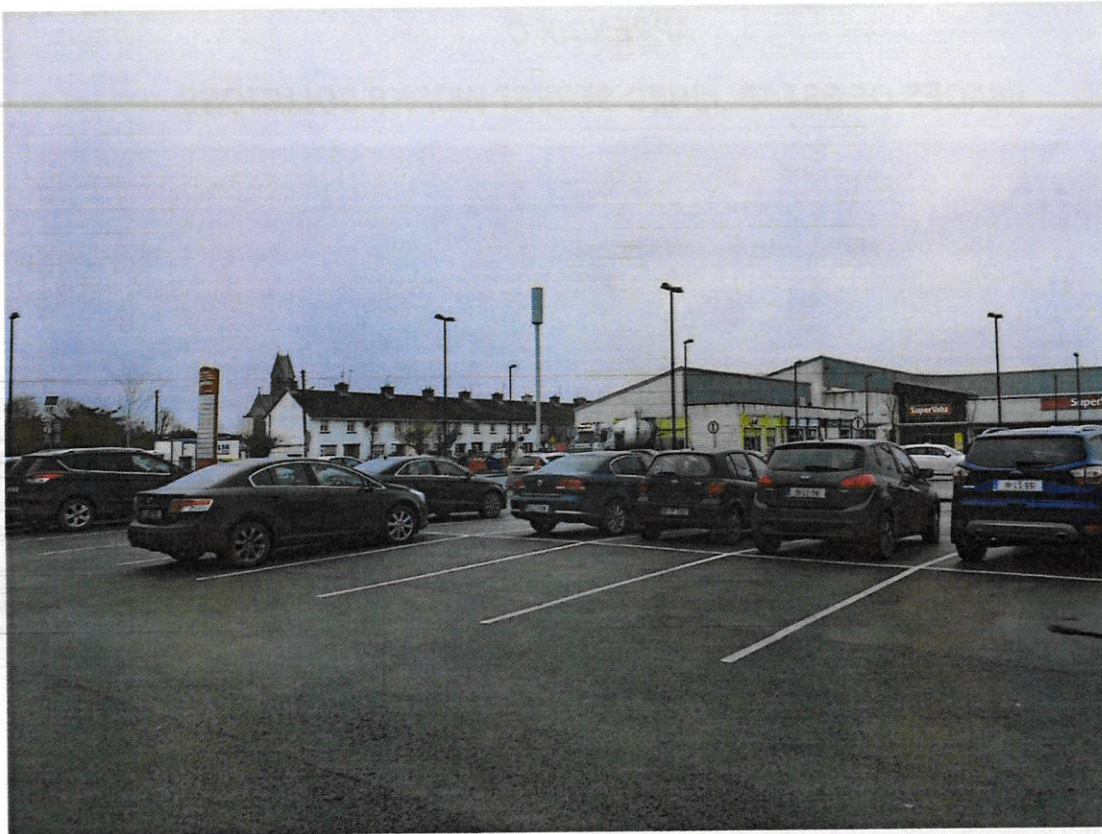
Streetworks Solution at Mountmellick, Co. Laois. (Structure is Lollipop Construct)