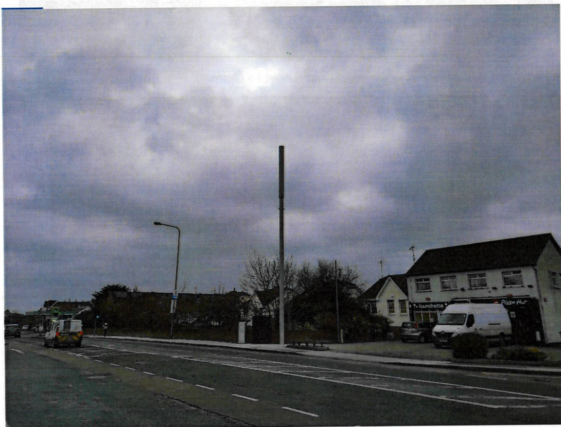
Street works at Dundalk Hospital, Co. Louth.