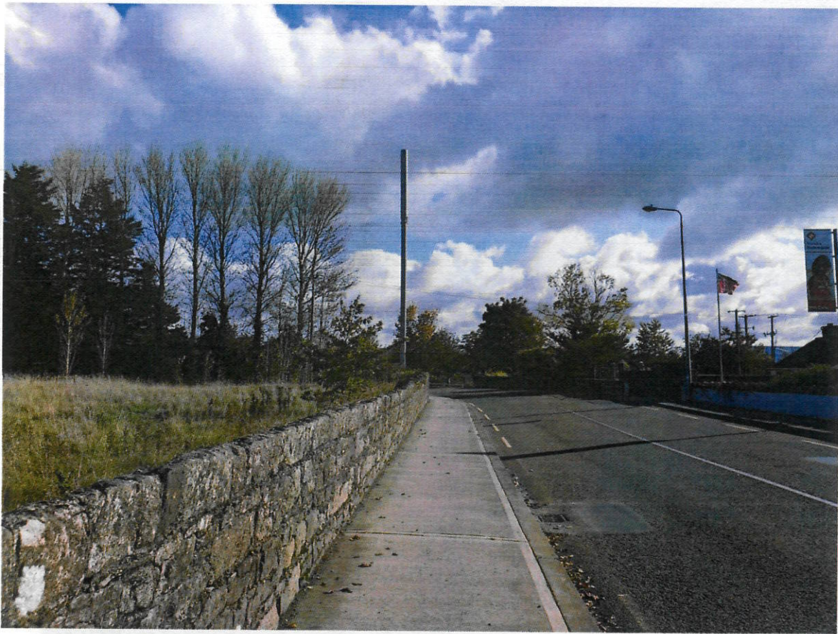
Streetworks solution at Bagenelstown, Co Carlow (Structure is Alpha 2.0 Construct)