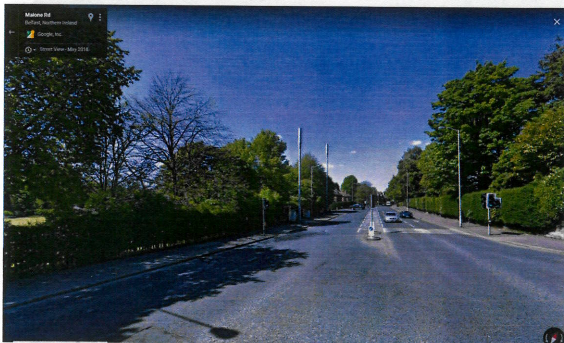
Streetworks Solution, Malone Rd., Belfast, Northern Ireland. (Structure is Alpha 2.0 Construct)