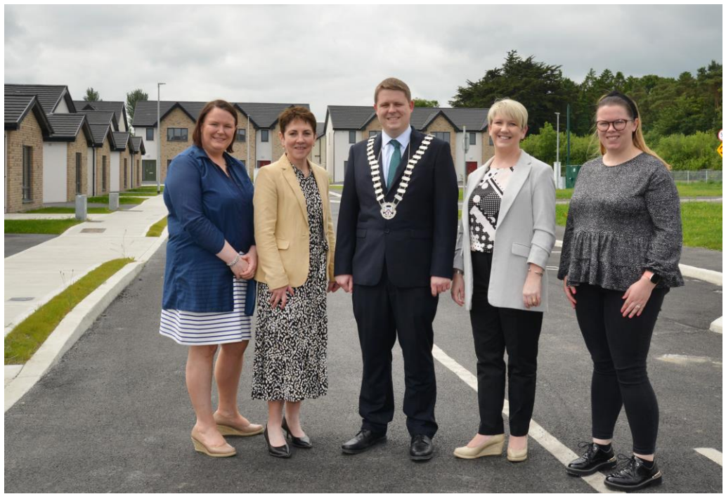
Droughill Lawns Portarlington - 26 House Development - Tuath Housing (AHB)

The total number of units delivered in 2022 was 216. These were provided via local authority direct construction, Part V, turnkey projects and in cooperation with Approved Housing Bodies.