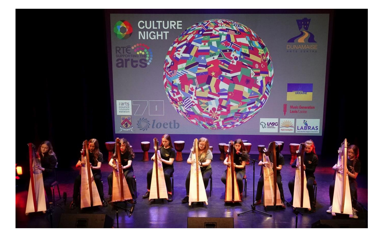
Music Generation concert as part of Culture Night 2022