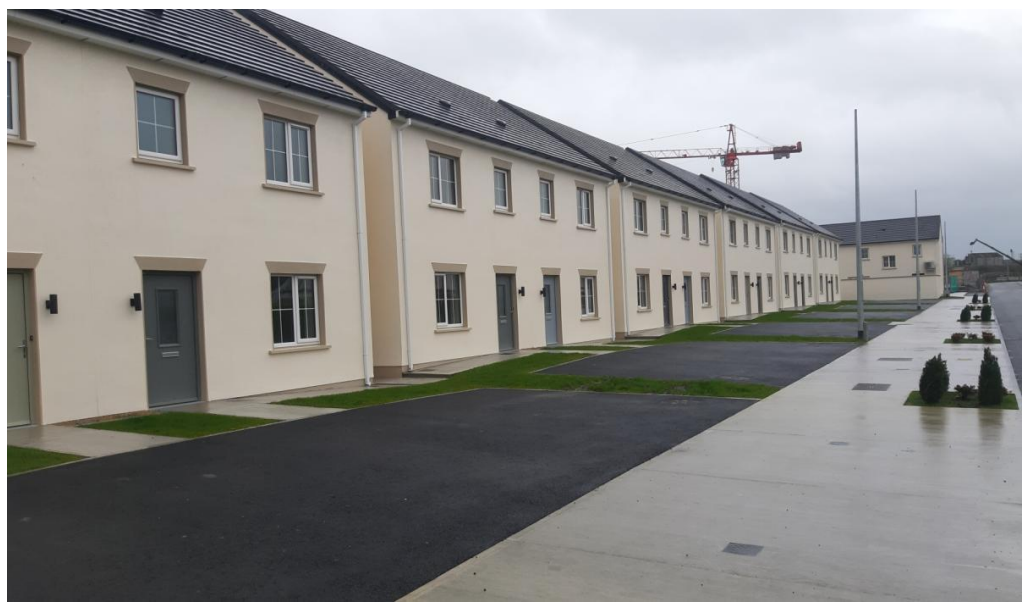
Roselawn, Portlaoise – 15 House Development - Cluid Housing (AHB)