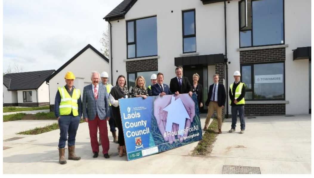
Sean Doire Durrow – 22 house development – Laois County Council Construction

22 direct build and turnkey capital schemes are currently in progress in Stradbally, Durrow, Rathdowney, Errill, Mountmellick, Ballyroan, Borris-in-Ossory, Killeen, Ballylinan, Doonane, Mountrath, Portarlington, Portlaoise and are being progressed through the Department's Capital Stage Approval process.