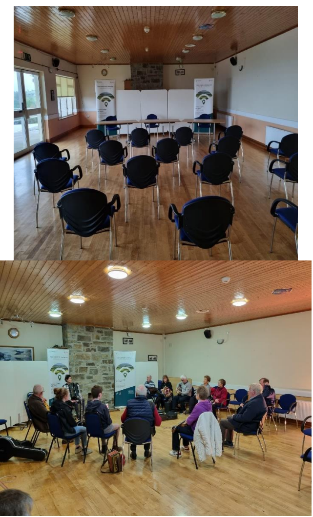
Broadband Connection Point Oisin House, Killeshin

These are public locations which have been selected to receive high-speed connectivity in the first year of the National Broadband Plan and are available to work or study within. These are part of the Connected Communities initiative.