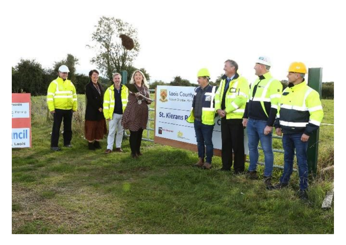
St Kierans Park Errill - Sod Turning – September 2022