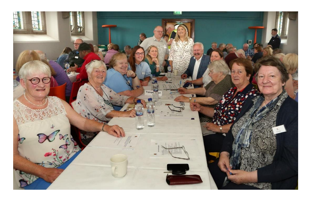
Age Friendly Strategy Consultation at Bloom HQ, Mountrath

The OPC convention took place for the first time since 2019 in Meath in May 2022. This proved to be a very positive and informative event which was attended by the Age Friendly Programme Manager and two members of the OPC.