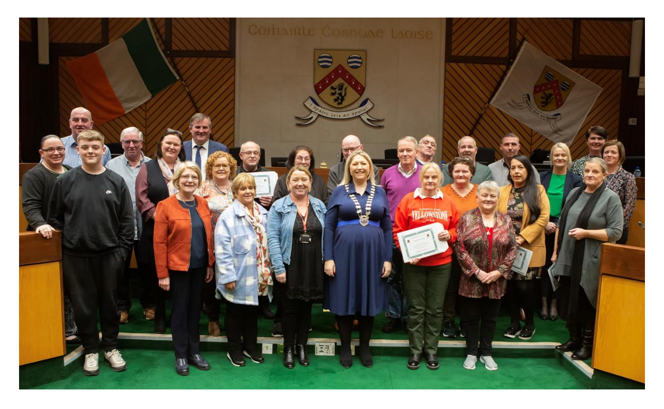
Awards ceremony for Knockmay Best Kept Garden 2022

Laois County Council held a Best Kept Garden Competition in the area and an award ceremony was held in November in County Hall.