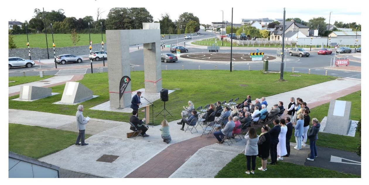
'Protectour,' by James Hayes, launch on Culture Night 2022

Laois Culture Night – This event proceeded on Friday 23rd of September 2022 and included a wide variety of free live and online events.