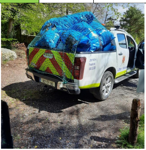
Bags of litter collected by voluntary groups 2021