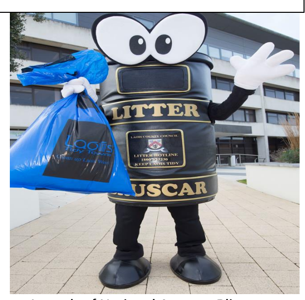
Launch of National Autumn Blitz