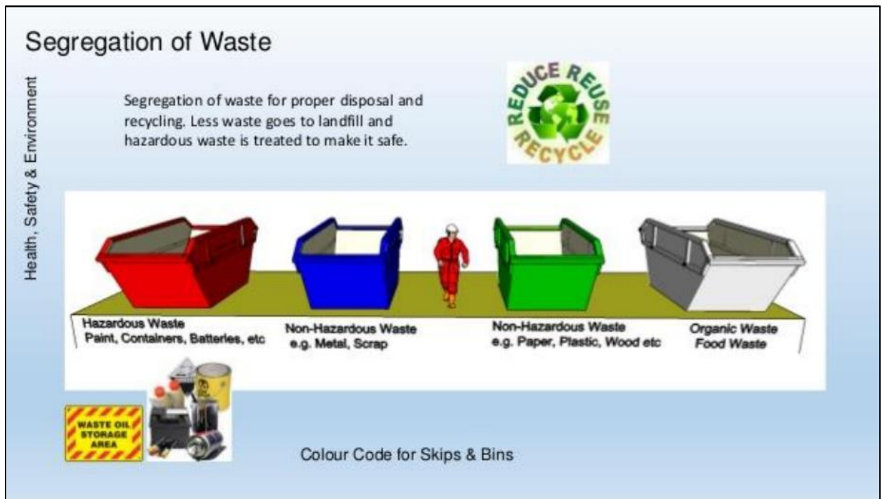
Figure 3 Segregation of Waste

The Waste Storage Area (WSA) shall be established in the designated Kilwex site compound on a hard standing. The WSA will have adequate space for storage and handling, suitable signage posted, Where required, skips will be covered.