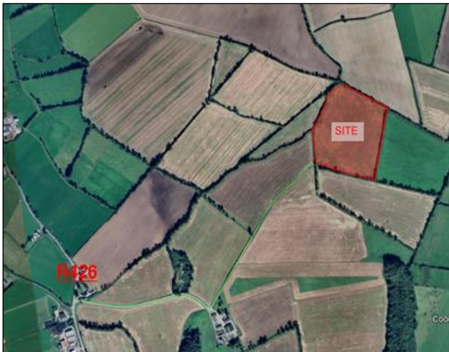
Figure 1 Map of Coolnabacky Site

The site comprises mainly grassland and is enclosed by watercourses and hedgerows. A gravel track is present along the southern boundary as well and from the southwest corner of the site up along the western boundary. The wider area is dominated by agricultural land (mainly improved grassland). Tufa formations within the watercourse along the western boundaries of the site have been identified. This watercourse eventually discharges to the river Barrow and river Nore cSAC / pNHA some 4.7 km northeast. Figure 1 shows site location.