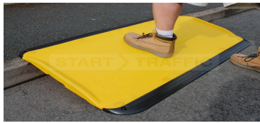
1.2m wide pedestrian ramps and or compact delay set ramps laid out at temporary bus stop areas