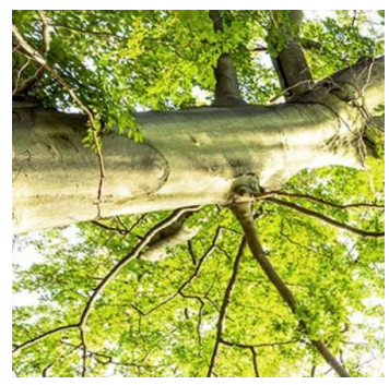
Heart of the Community Fund