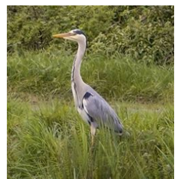
Community Heritage and Biodiversity Grant Programme