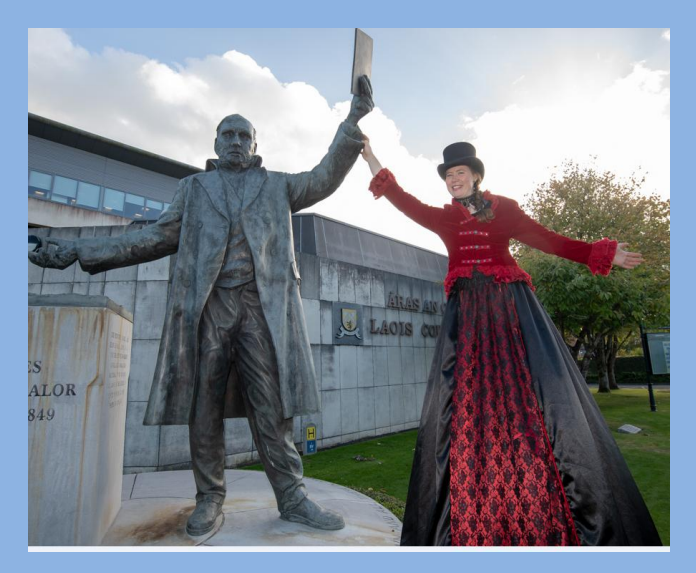
Circus Skills performance at Áras an Chontae on Culture Night 2018