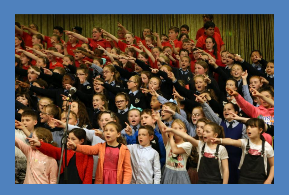
Performance by Youth Dance Ensemble for Cruinniu na nÓg

Music Generation Laois Schools Out for Summer Concert at the Heritage Hotel, Killenard