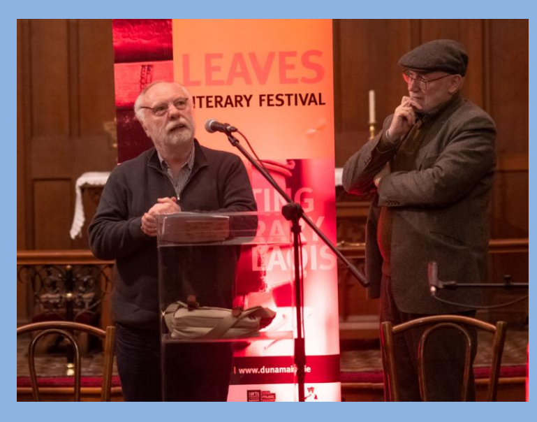
Opening of "Welcome to May" exhibition by Stradbally Active Age Group at Laois Arthouse, Stradbally