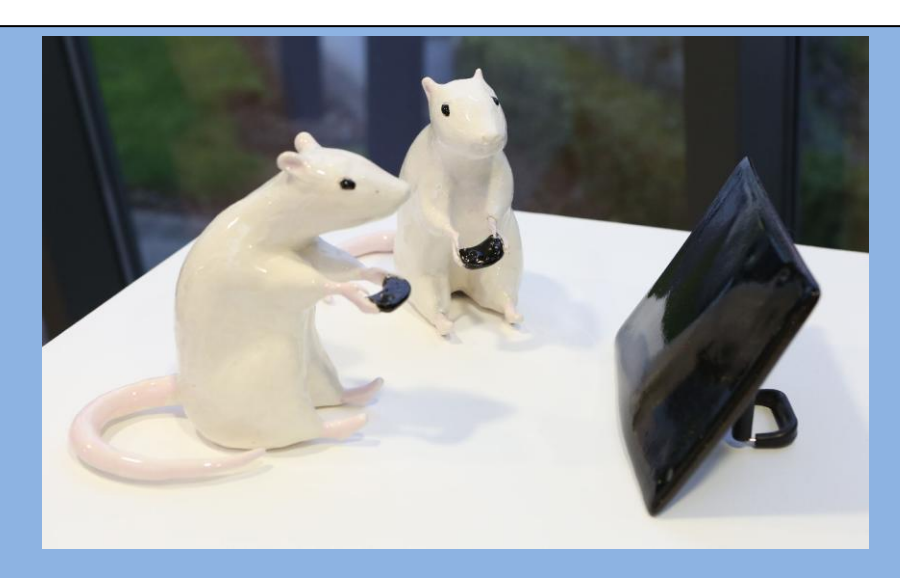
Exhibits from Laois Arthouse, Stradbally Residents Exhibition "The Stradbally Six"