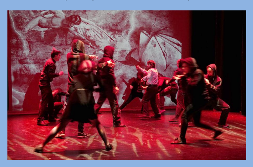
Scene from Laois Youth Theatre performance of "Black Eyes" at the Dunamaise Arts Centre in May 2018