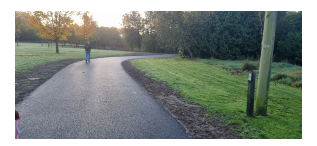
Triogue Greenway Update

We are continuing with great strides on improving the active travel in Portlaoise. The pathways in the People's Park and Linear Park have been widened as part of the Triogue way works.