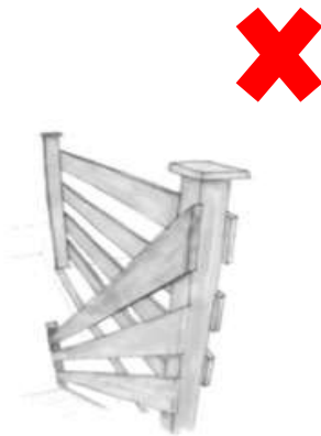
An example of an unsound stair guarding