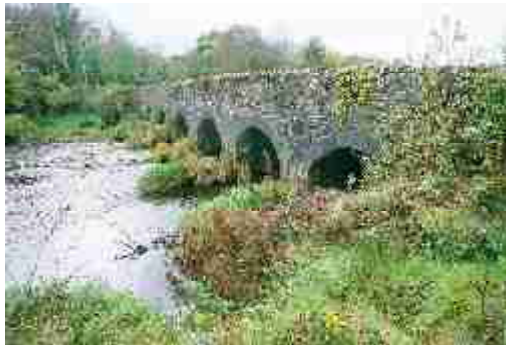
LAIAR-017-033_03 FWH 01/11/2007 Downstream (E) elevation from right bank.