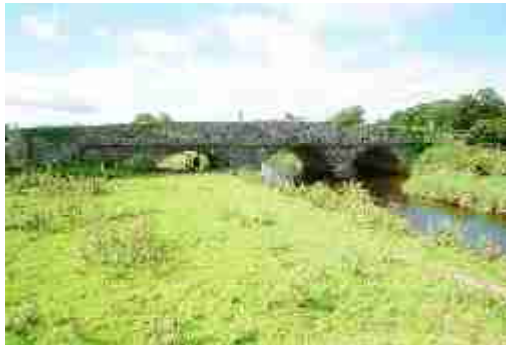
LAIAR-016-006_03 FWH 30/08/2007 Voussoir detailing on upstream/right-bank arch.