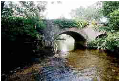
LAIAR-016-007_03 FWH 30/08/2007 Damage caused by shrub to upstream river cutwater.