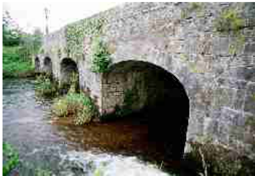
LAIAR-016-015_06 FWH 30/08/2007 Looking up 2nd arch from left bank, showing soffit break. Note arch voussoir.