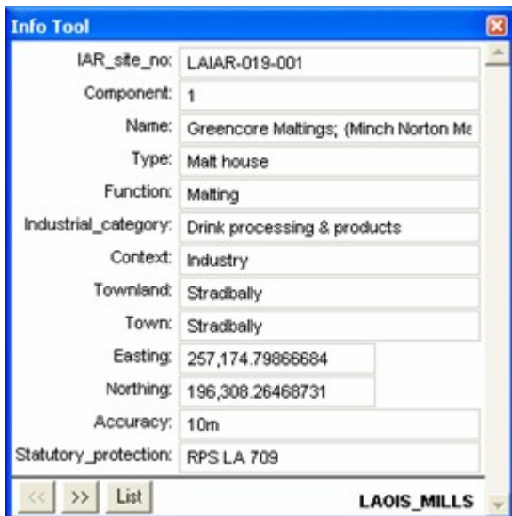
Fig.1.1 Above: Example of map and data generated using MapInfo .

Left: Enlargement of the 'Info Tool' table. It shows that this particular component is a malt house which is also in the Record of Protected Structures (record Laois 709).