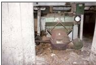
LAIAR-008-032_06 29/07/2005 Kiln drying floor.