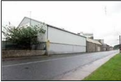
LAIAR-005-010_07 28/07/2005 View of site from south-east.