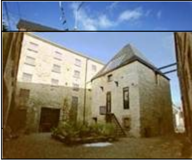
LAIAR-014-012_06 14/09/2005 Kiln 1, from NE.