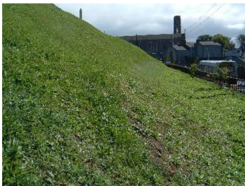
The Ridge Graveyard, Portlaoise, is on "The Ridge of Portlaoise" esker

An Action of the Laois Heritage Plan 2002-2006