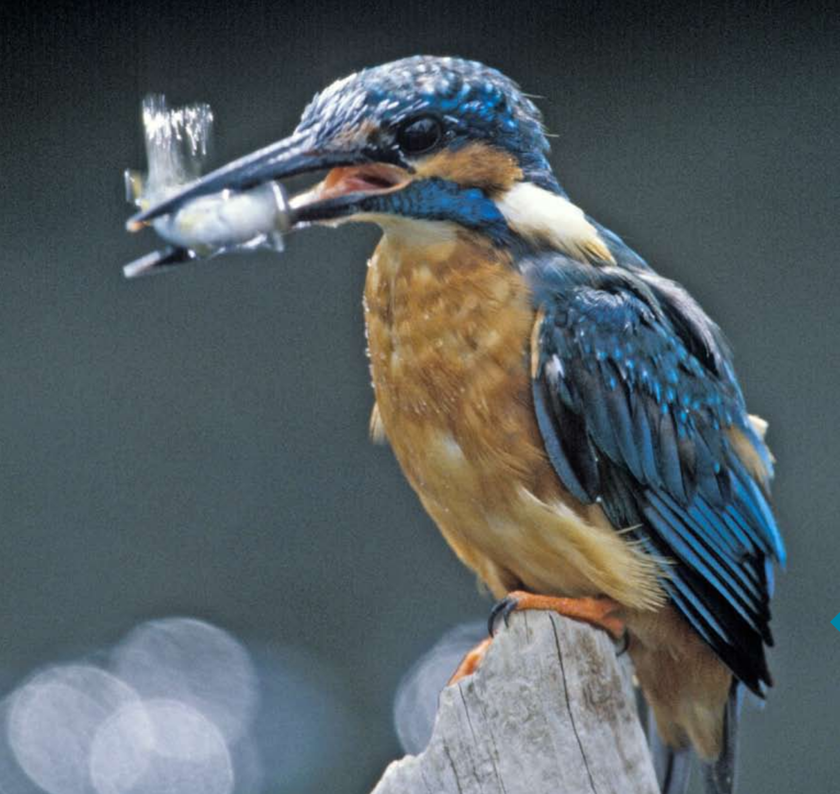
Kingfisher feeding by the riverside