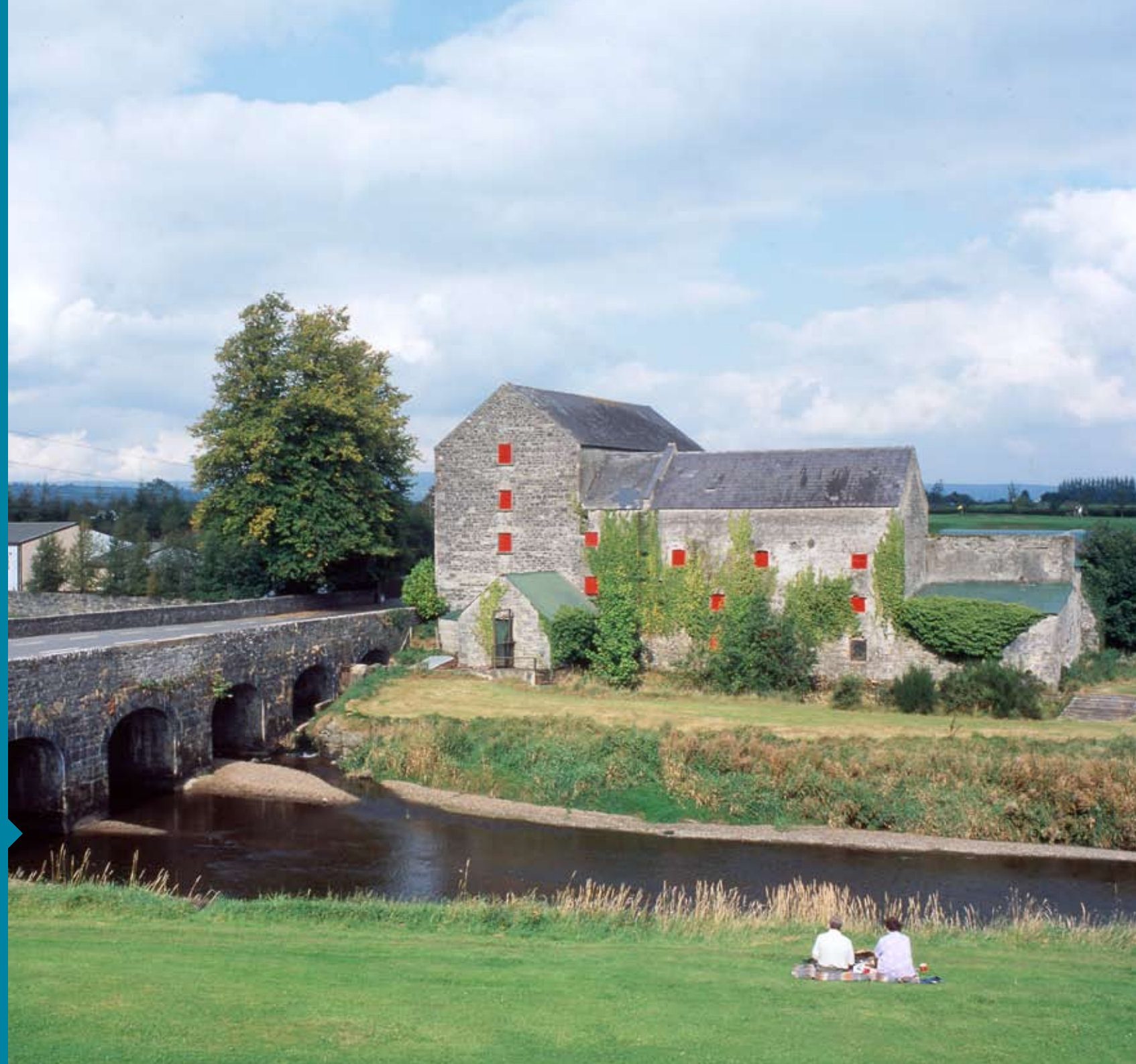
Knockanina Mill, on the River Nore, Castletown