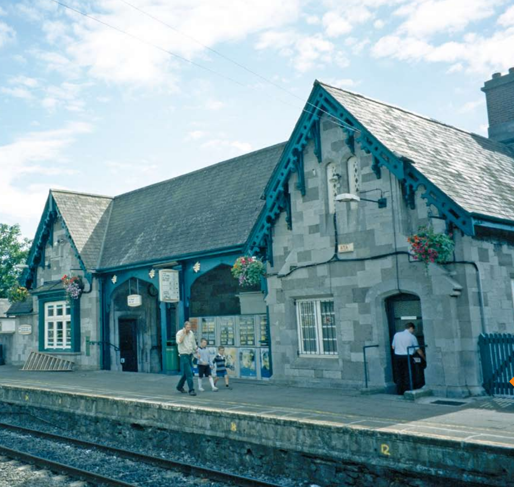
Portlaoise Railway Station