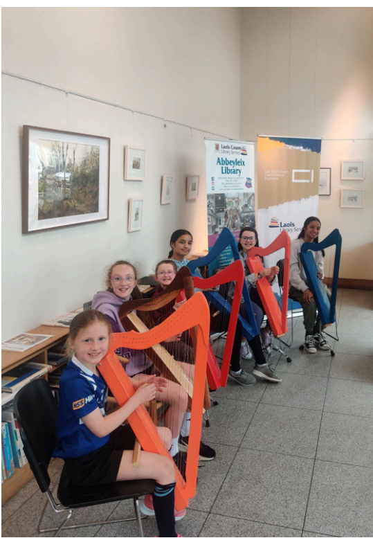
Cruinniú na nÓg at Laois Libraries