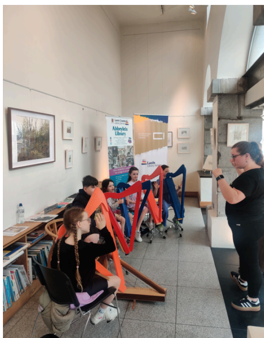
Laois Cruinniú na nÓg