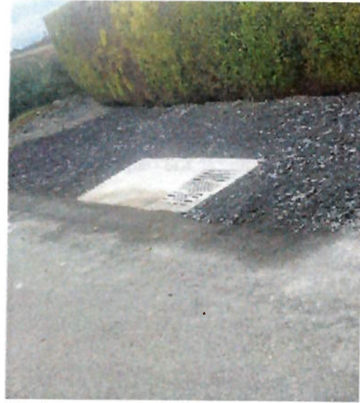
Drainage improvements works The Pike