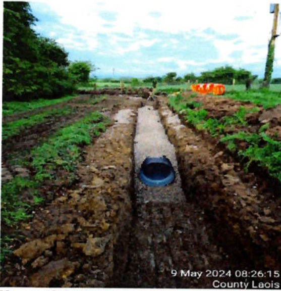
New outlet pipe under installation Green Roads

Drainage & resilience improvement works have commenced at a number of locations across the respective Municipal District's to increase and improve surface water management at vulnerable locations.