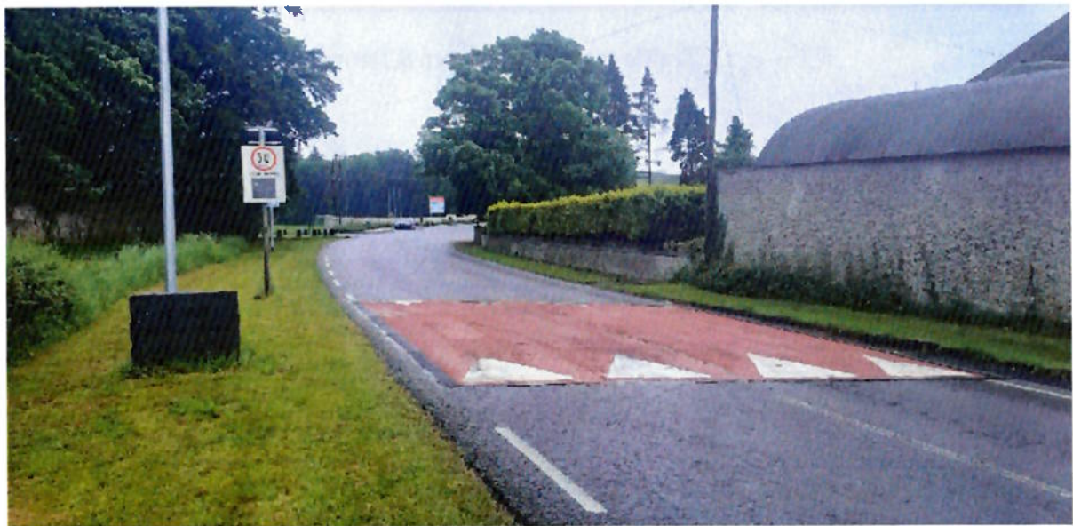
Installation of traffic calming ramp adjacent to Emo National School