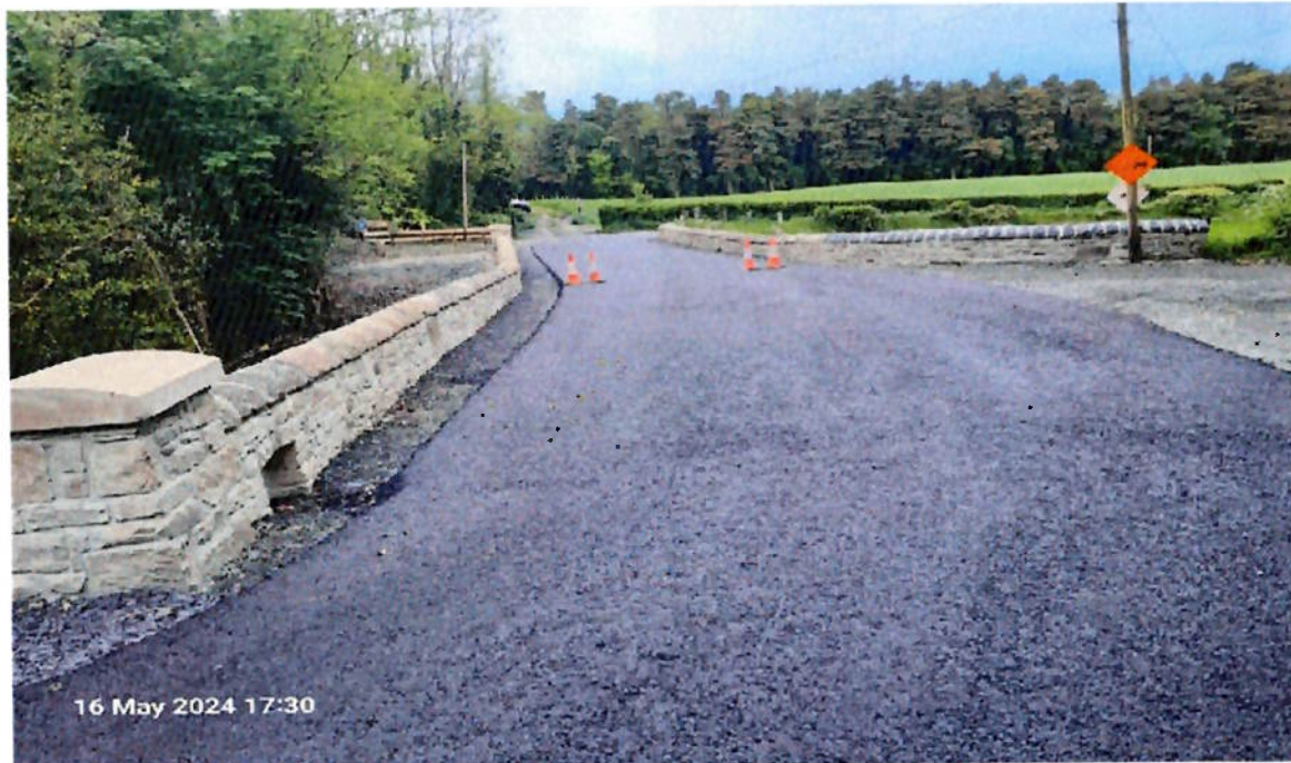
Road Strengthening & Bridge rehabilitation works in Brittas, Clonaslee

The annual roads programme has commenced with a number of schemes complete and others currently ongoing in the respective Municipal Districts.