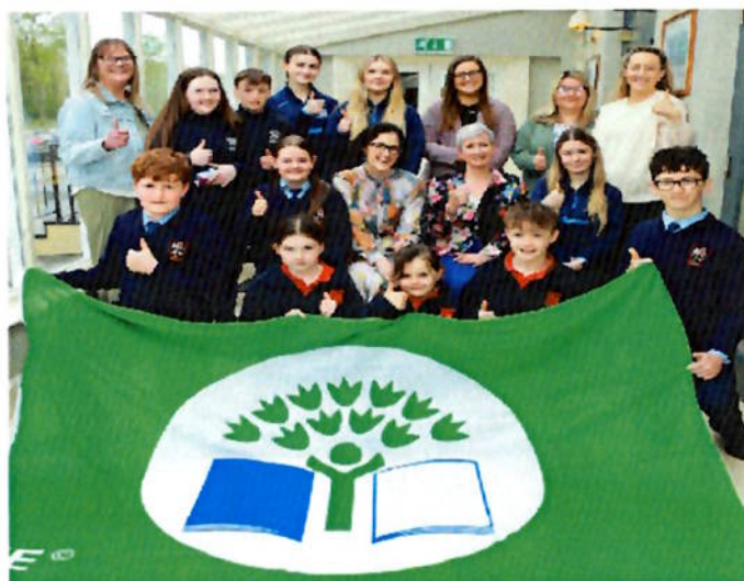
Getting ready to get on the bus to Kilkenny!

Global Citizenship Travel theme – Derrymalogue NS