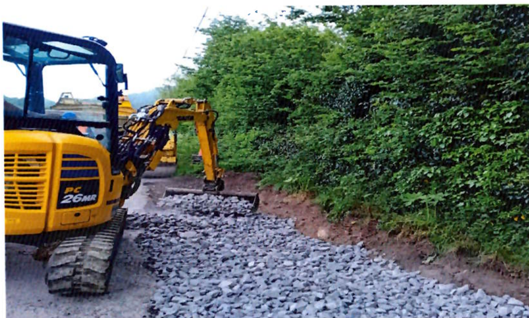
Preparation works in advance of road strengthening at Ballycarroll