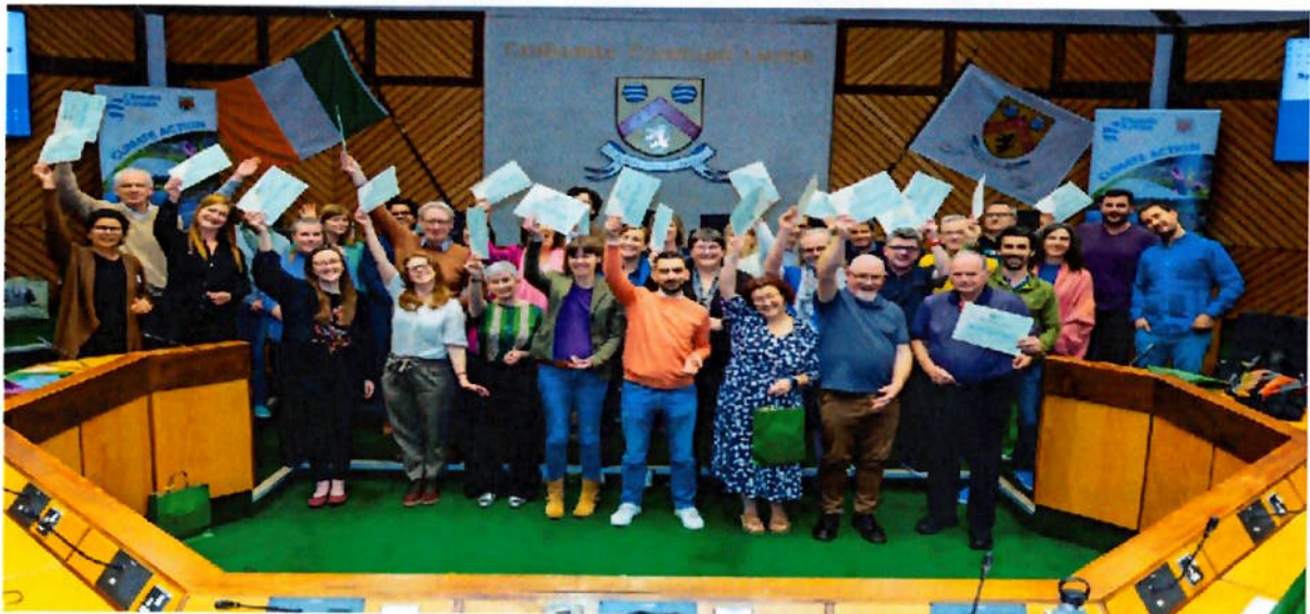
Class with their certificates of completion