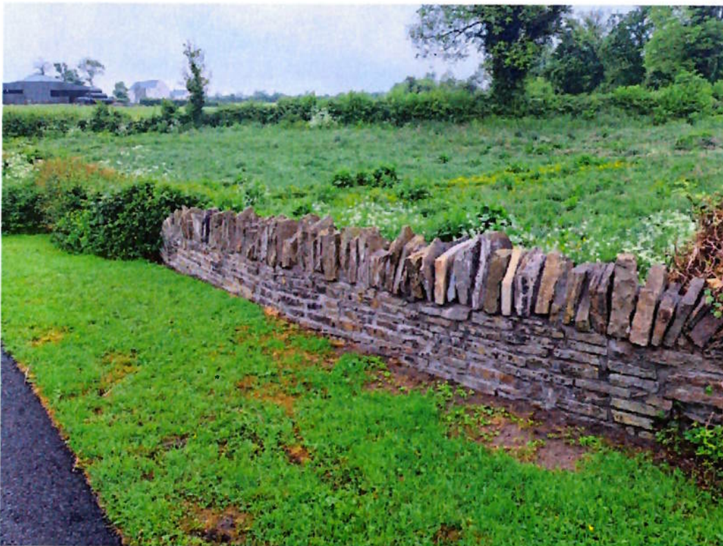
Repair works at Shanragh