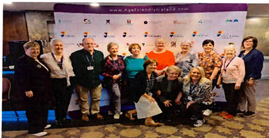
Midlands Older Peoples Councils at OPC convention- Longford , Westmeath, Offaly, Roscommmon and Laois