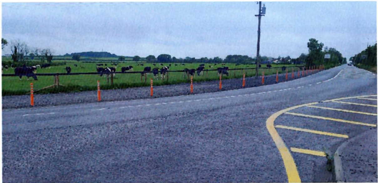
Safety Improvement Works at R424/R420 Junction, Lea Rd, Portarlinton.