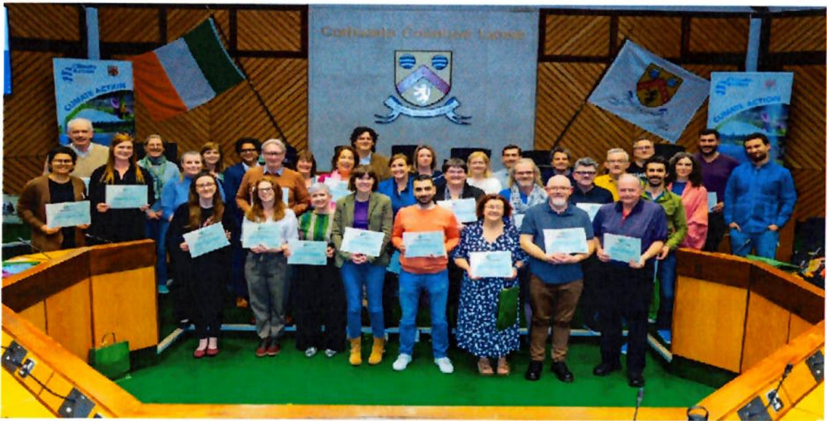
Participants on SISEC course representing 32 Laois organisations