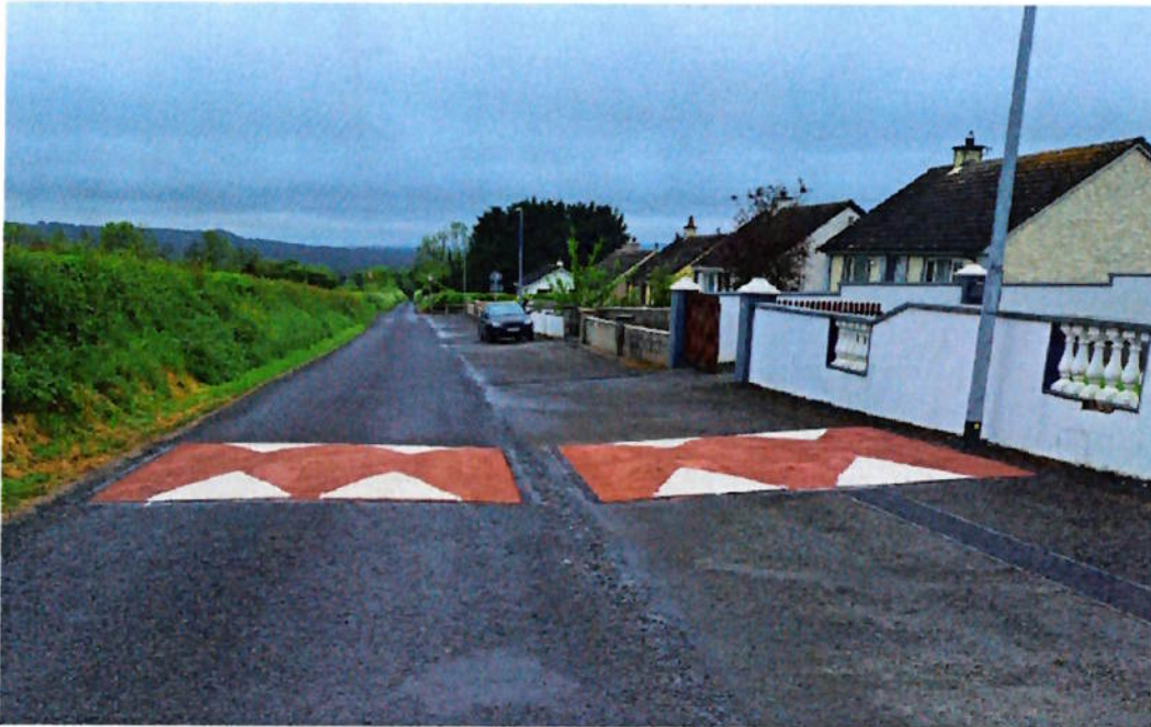
Traffic calming Newtown & Doonane