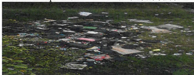
Continuous Dumping at Bruders Bridge, Togher (Clonminam Industrial Park side) Portlaoise

Waste Enforcement continue to tackle illegal Dumping in various problematic areas within the County in accordance with the current legislation. Enforcement efforts are limited by virtue of the current prohibition on the use of CCTV.