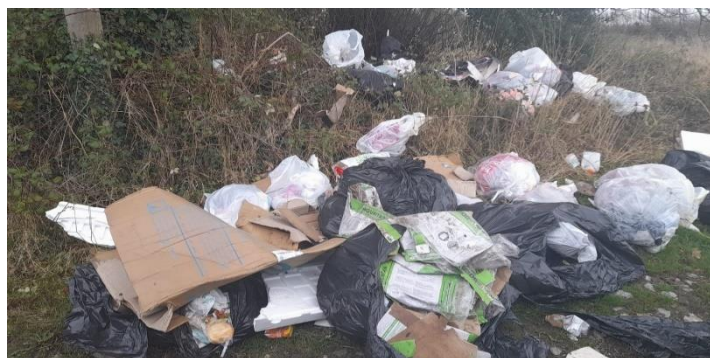
Table 2 below shows quantities of illegally dumped waste collected in 2021

Waste Enforcement continue to tackle illegal dumping in various problematic areas within the County in accordance with current legislation. Enforcement efforts are limited by virtue of the current prohibition on the use of CCTV etc.