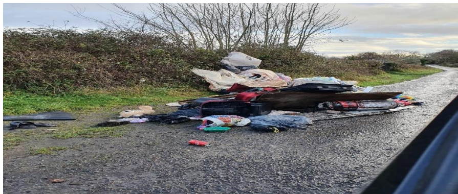
Large Dump at Springhill Killeshin causing serious danger to road users

Illegal waste was removed during the months of December & January, with a marked increase of rubbish being collected from various areas, such as Springhill, Killeshin; Fanning Pass Slieve Bloom; Canal Rd, Portarlinton; Corrig; Spindlewood, Glendine Camross, St. Fintans Terrace, Mountrath, Clonminan, Jessop Street and Redcastle Mountrath. this possibly is as a result of the holiday period.