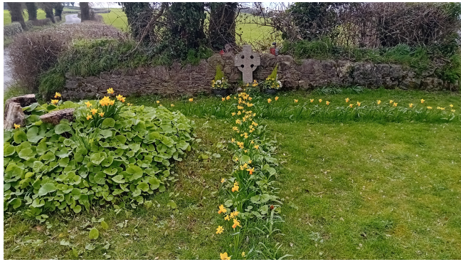
Site of proposed cillin memorial at Tonduff Cross.