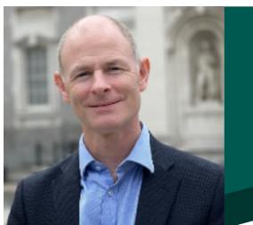
Ossian Smyth, T.D. Minister of State with responsibility for Public Procurement, eGovernment and Circular Economy

The implementation of this Green Public Procurement Strategy and Action Plan will ensure that public bodies play a critical part in supporting the delivery of important commitments on climate action, and helping our transition to a circular economy.