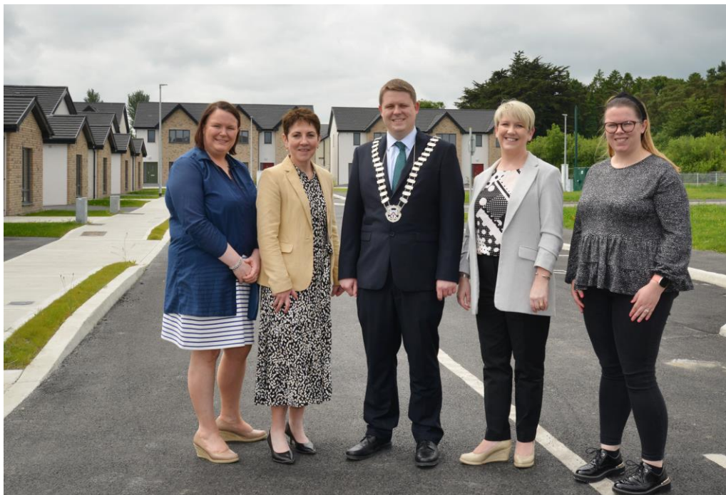
Droughill Lawns Portarlinton - 26 House Development - Tuath Housing (AHB)

The total number of units delivered in 2022 was 216. These were provided via local authority direct construction, Part V, turnkey projects and in cooperation with Approved Housing Bodies.