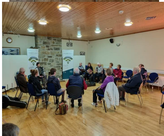
Broadband Connection Point Oisin House , Killeslin