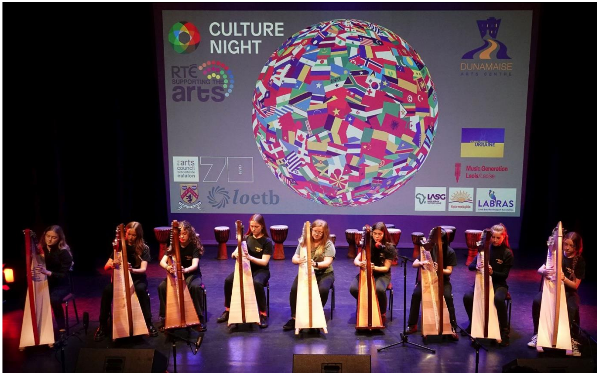
Music Generation concert as part of Culture Night 2022