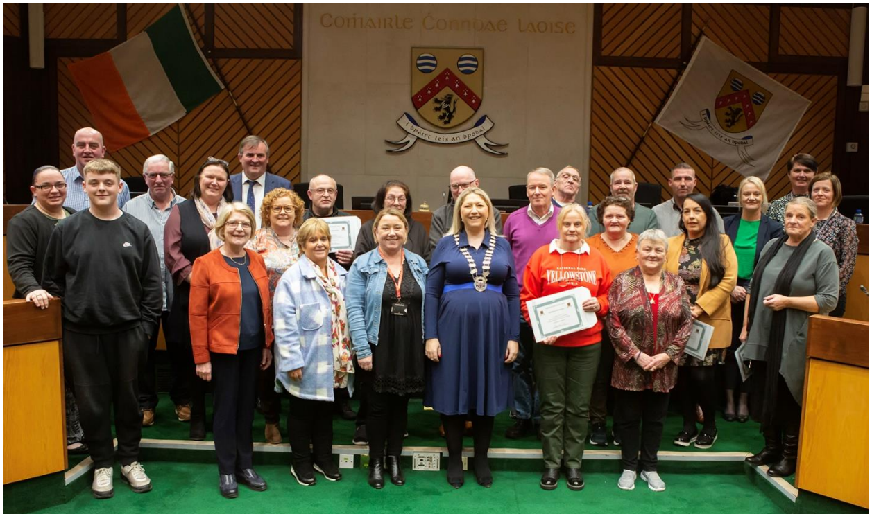
Awards ceremony for Knockmay Best Kept Garden 2022

Laois County Council held a Best Kept Garden Competition in the area and an award ceremony was held in November in County Hall.