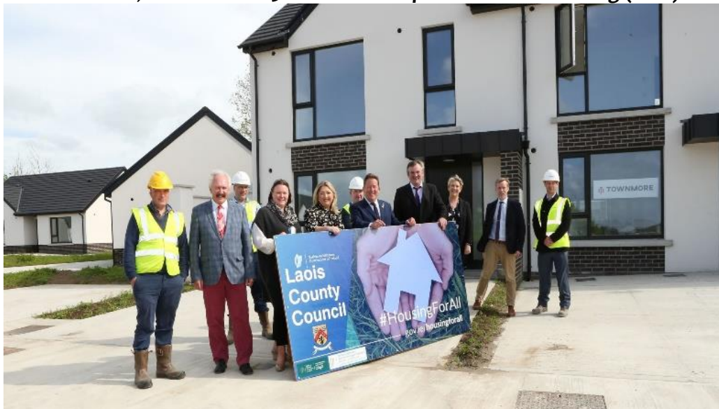
Sean Doire Durrow – 22 house development – Laois County Council Construction

22 direct build and turnkey capital schemes are currently in progress in Stradbally, Durrow, Rathdowney, Errill, Mountmellick, Ballyroan, Borris-in-Ossory, Killeen, Ballylinan, Doonane, Mountrath, Portarlinton, Portlaoise and are being progressed through the Department's Capital Stage Approval process.