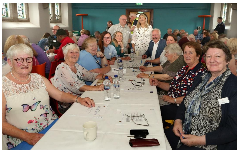
Age Friendly Strategy Consultation at Bloom HQ, Mountrath

The OPC convention took place for the first time since 2019 in Meath in May 2022. This proved to be a very positive and informative event which was attended by the Age Friendly Programme Manager and two members of the OPC.