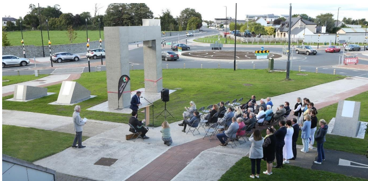
'Protectour,' by James Hayes, launch on Culture Night 2022

Laois Culture Night – This event proceeded on Friday 23rd of September 2022 and included a wide variety of free live and online events.