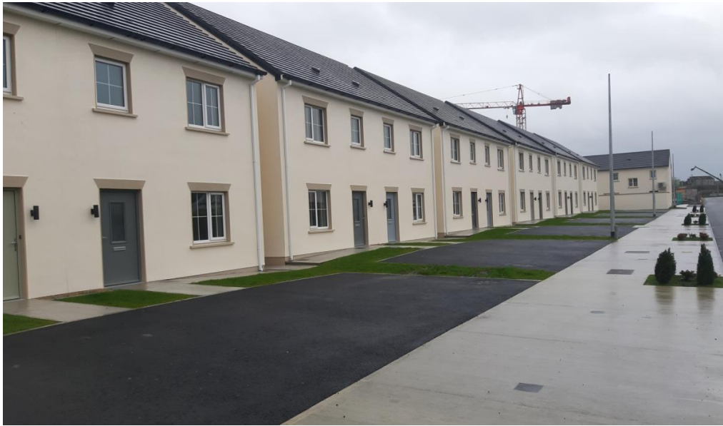
Roselawn, Portlaoise – 15 House Development - Cluid Housing (AHB)