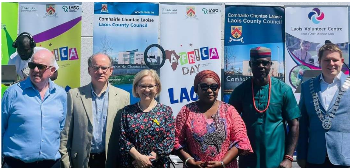
Laois Africa Day 2022