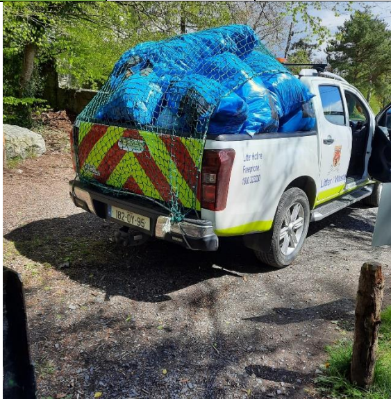
Bags of litter collected by voluntary groups 2021 Being taken to landfill by Litter Warden