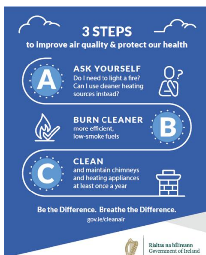
Advertisement for three steps to improve air quality, promoted through local press in December 2021.