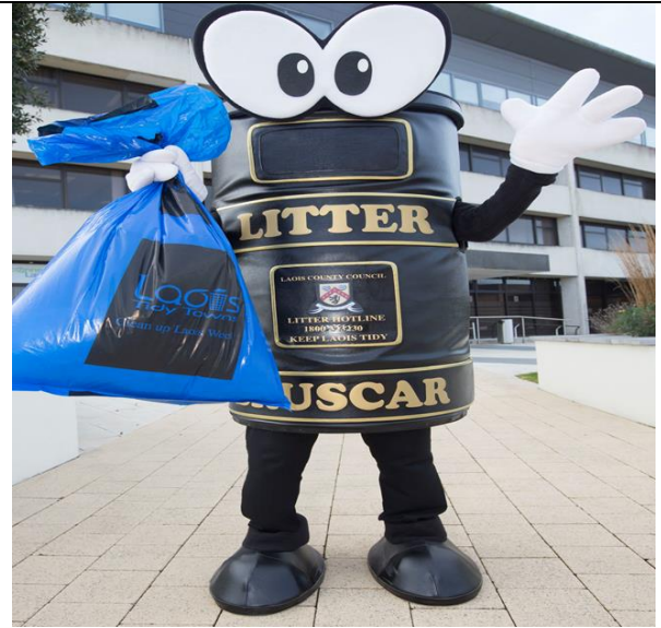
Launch of National Autumn Blitz