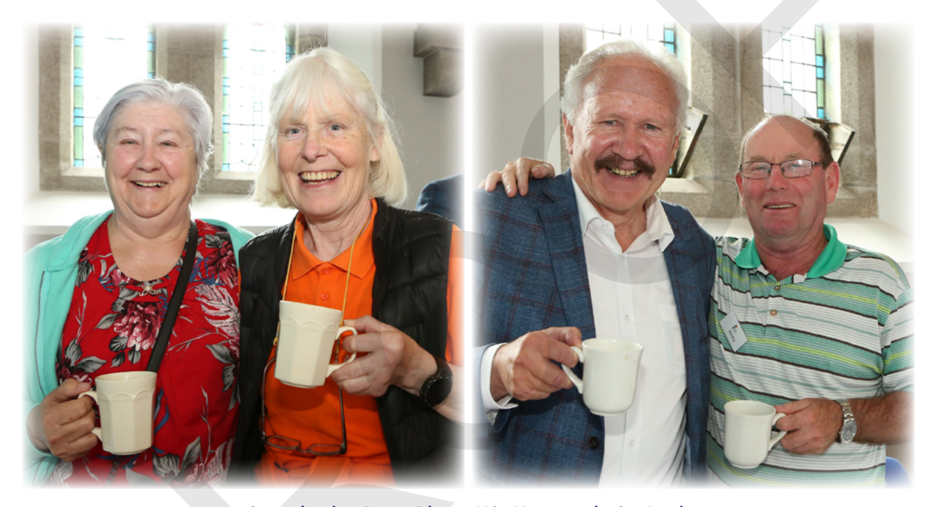
Consultation Day - Bloom HQ, Mountrath, Co. Laois