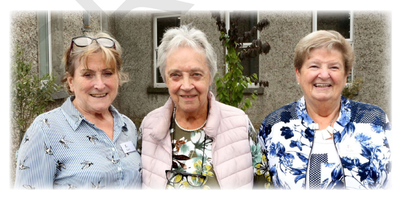
Consultation Day - Bloom HQ, Mountrath, Co. Laois

The contribution of Laois Volunteer Centre in providing and promoting opportunities to remain active was recognised and it is important that they are supported. A sense of purpose features heavily across studies and was a theme at the 2022 Older Persons Convention in Meath.