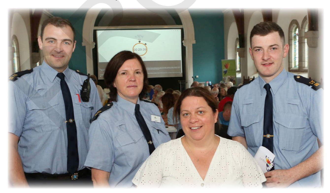
Consultation Day - Bloom HQ, Mountrath, Co. Laois

Delivery Partners: Older Persons Council, Laois PPN, Health Service Executive (HSE), Laois Volunteer Centre, Healthy Laois