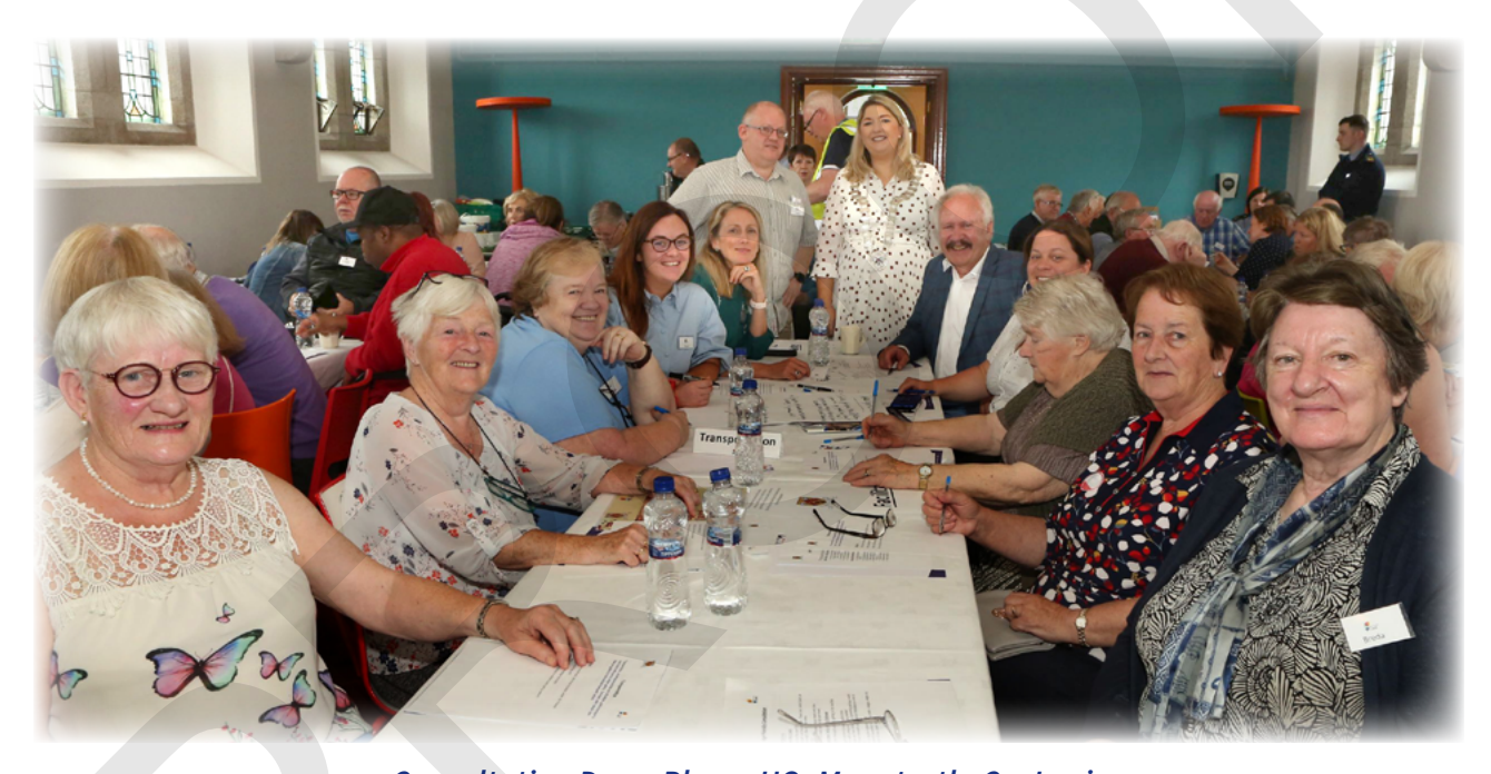
Consultation Day - Bloom HQ, Mountrath, Co. Laois

In addition, events and activities will be planned to encourage and maximize the full participation of the older community in society. Intergenerational project opportunities will be important in facilitating this and will benefit all age groups.