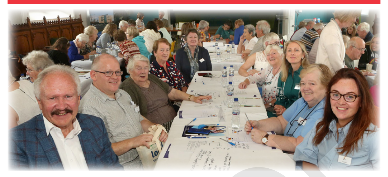
Consultation Day - Bloom HQ, Mountrath, Co. Laois

Older people have the information they need to live full lives. "Any official form filling causes stress, it's only natural. Communication and access to information is one of the most important aspects of ageing and effects everything"