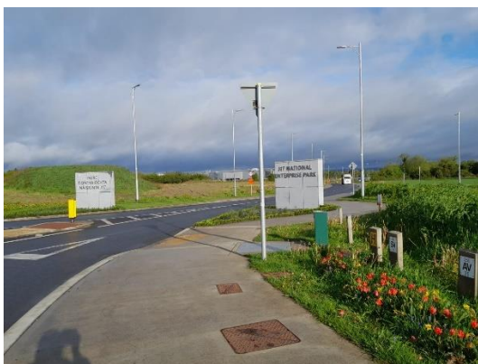
Junction 17 National Enterprise Park Portlaoise