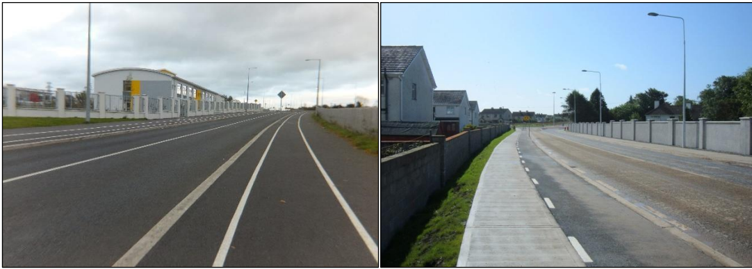
Portlaoise: section of Southern Relief Route with new schools campus, [left] section of WOR at Clonrooske [right]