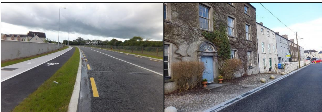
Crossneen, Carlow: extended section of Northern Relief Road [left] and Durrus Square refurbishment [right]